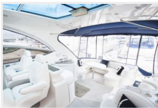
Cockpit - Aft