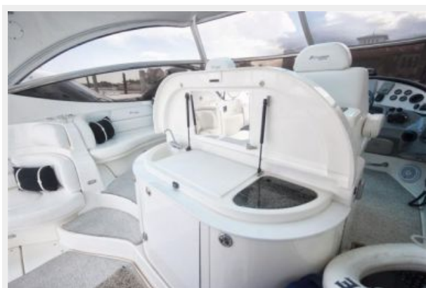
Cockpit - Wetbar