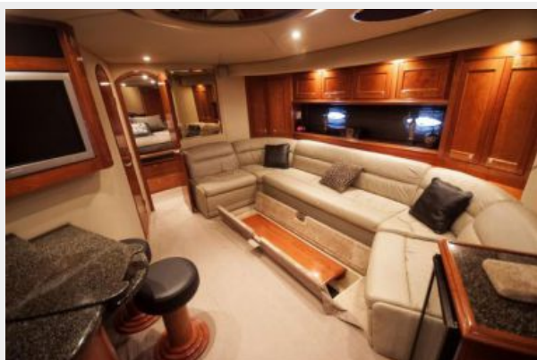
Salon Stow-Away Table