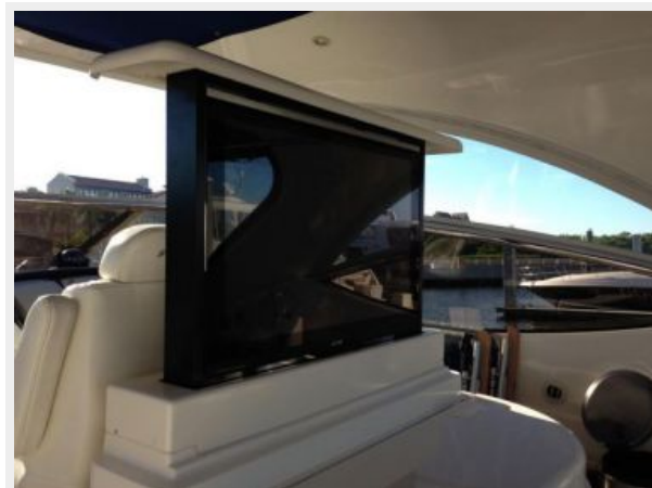
Cockpit-Large Screen TV