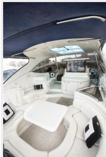
Cockpit - Forward