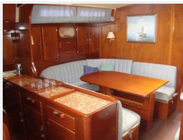
Salon - Port side