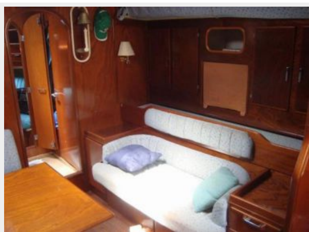
Salon- Starbd side