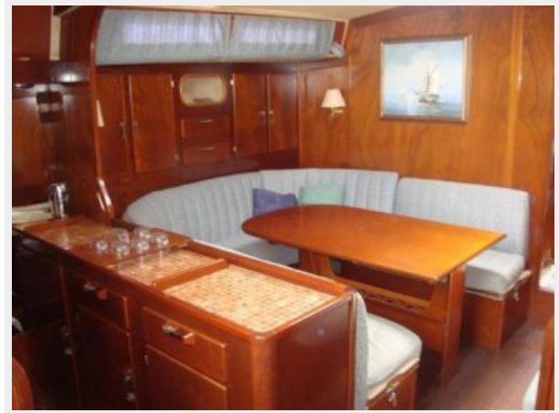
Salon - Port side