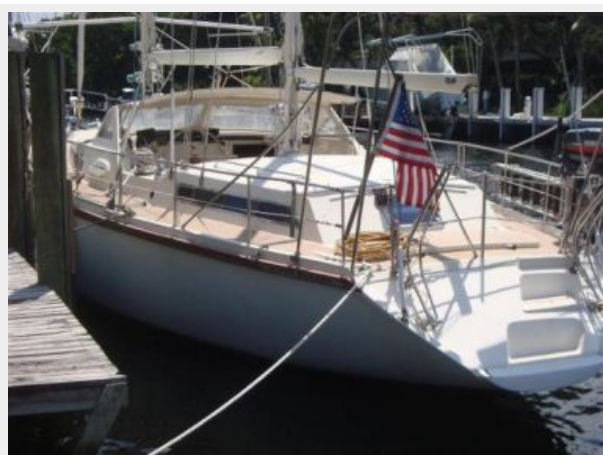
Stern View - Swim Platform