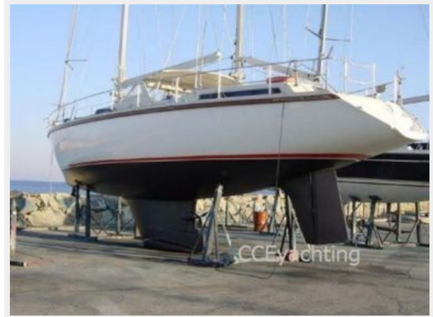
Out of water - SISTERSHIP