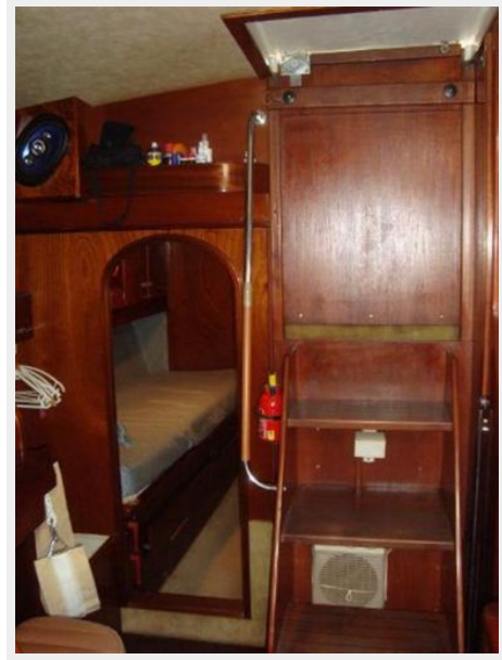
Companionway - to Aft Cabin