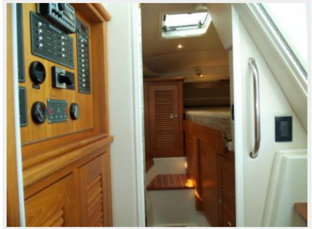
Port Hull Looking Forward