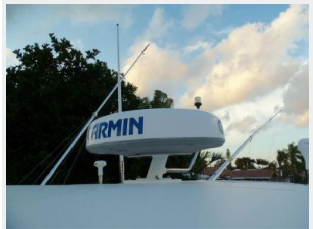
New Garmin Radar