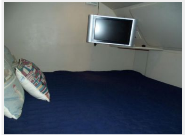
Master Looking Inboard