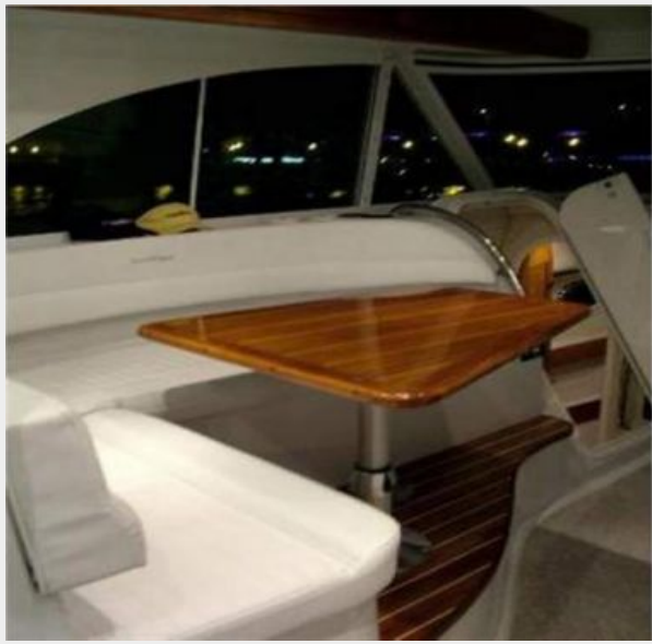
Upper Cockpit Settee