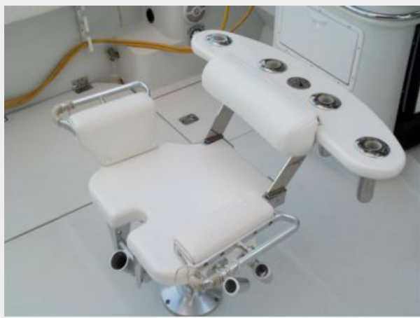
Rocket Launcher Backrest