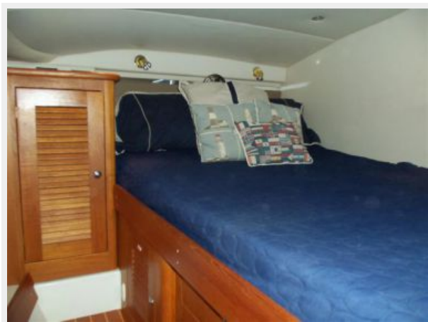
Master Looking Forward