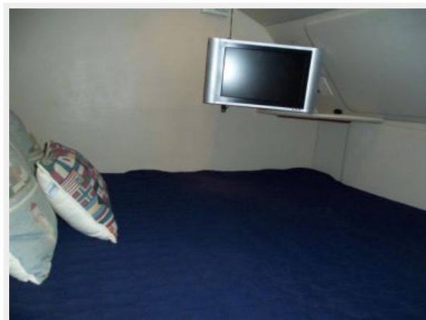
Master Looking Inboard