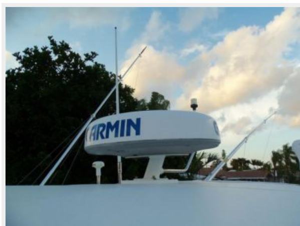
New Garmin Radar