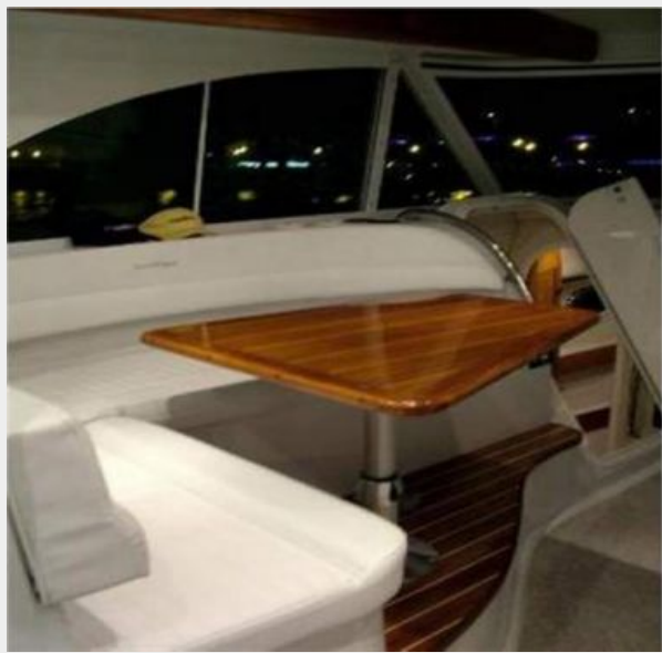
Upper Cockpit Settee