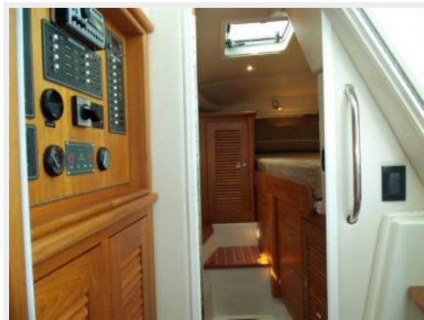
Port Hull Looking Forward