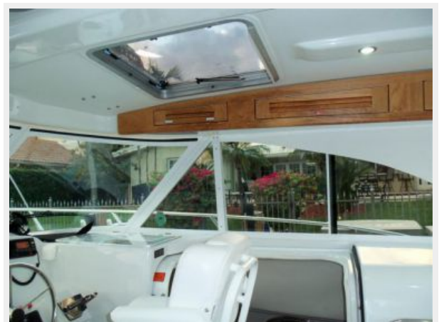
Starboard Side Hull Entry