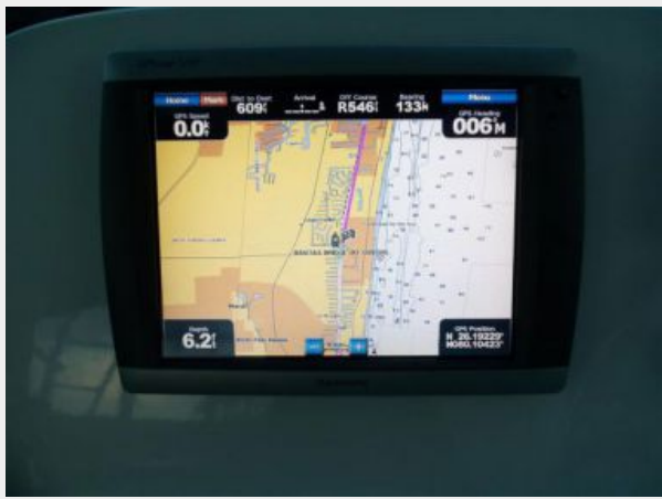
New Garmin 5212