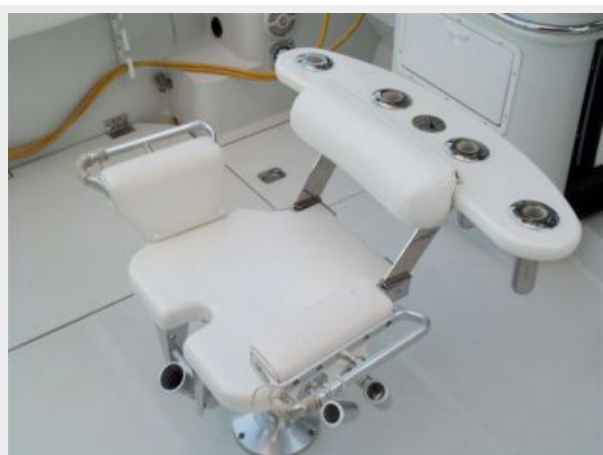
Rocket Launcher Backrest