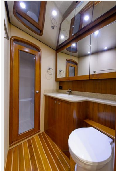
Master EnSuite Head