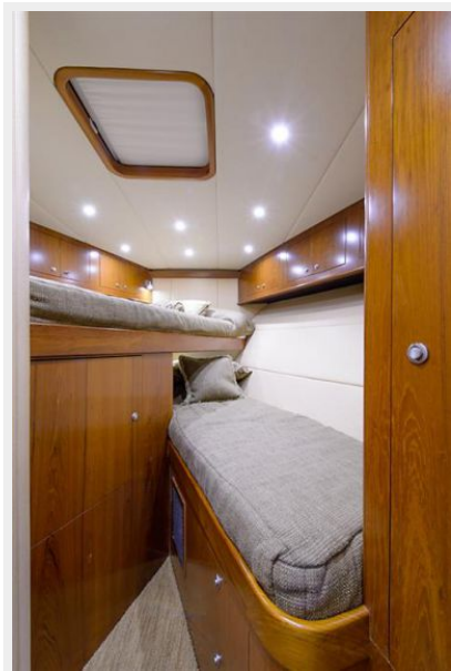
Fwd Guest Stateroom