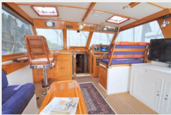
guest cabin office 2