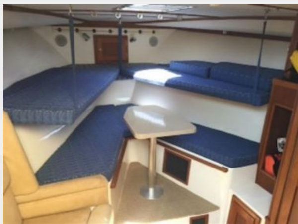
Main Cabin 1