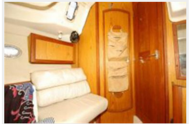
PORT SIDE VIEW MASTER STATEROOM