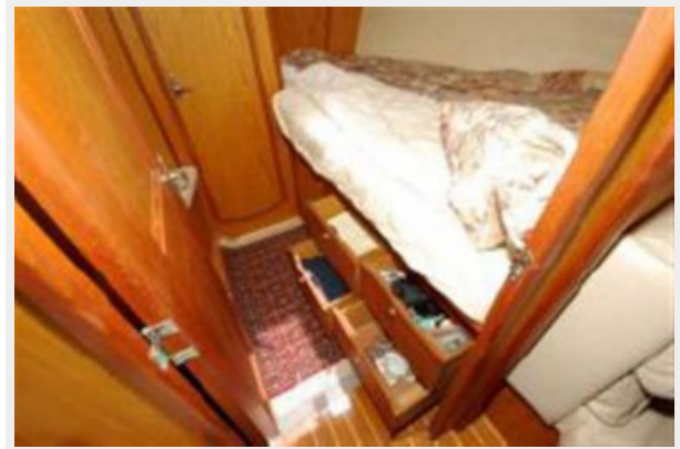
GUETS CABIN STORAGE