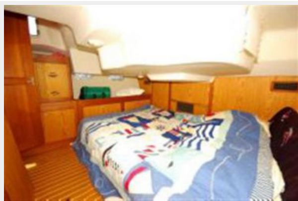
MASTER STATEROOM VIEW TO STARBOARD