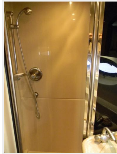
Master Shower Stall