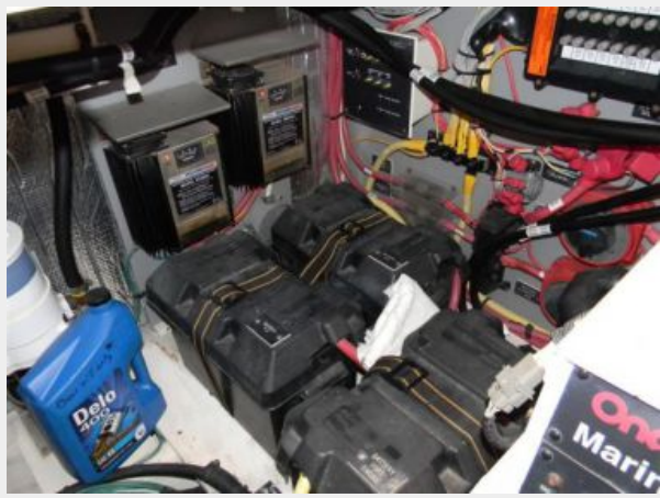
Port Engine Room and Batteries