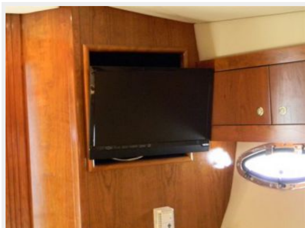
Digital TV - Forward Stateroom