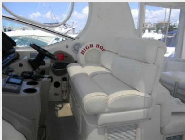
Double Wide Helm Seat