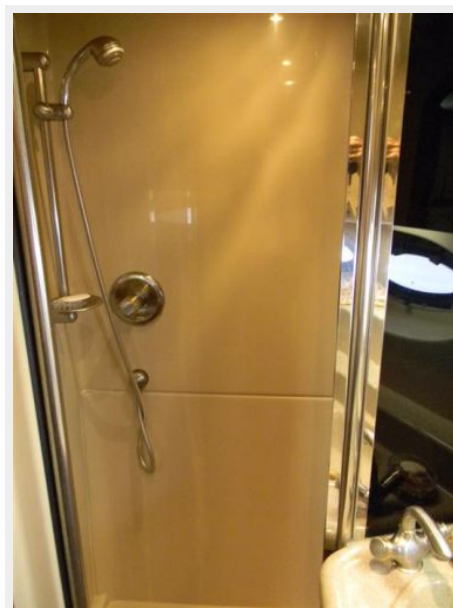
Master Shower Stall