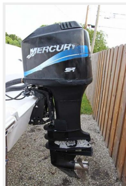
2001 Mercury 225 EFI (New Powerhead 10/07)