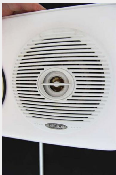
Clarion Marine Speakers