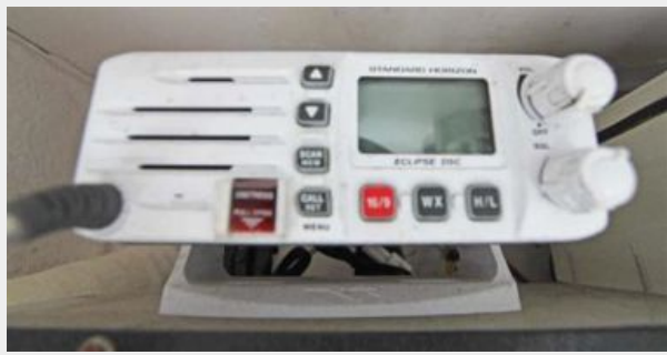
Standard Horizon Marine VHF Radio