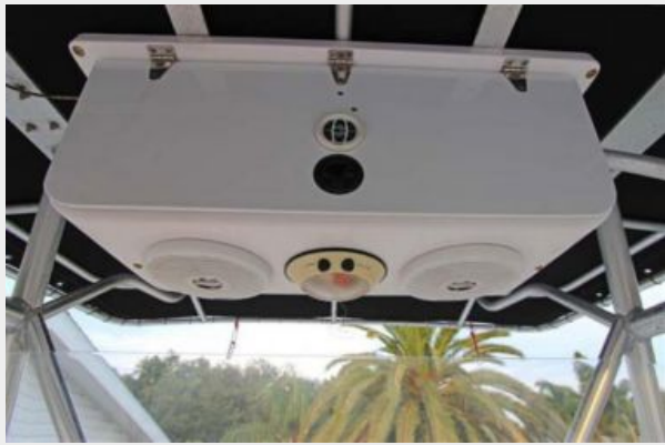
Center Console Electronics Box