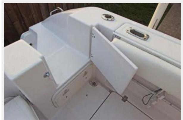
2001 Mercury 225 EFI (New Powerhead 10/07)