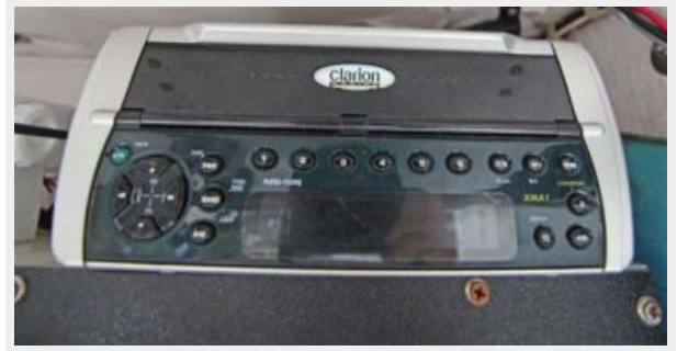
Clarion Marine Stereo/CD Player