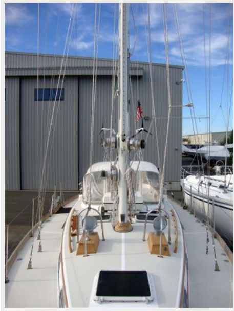
Deck Looking Aft