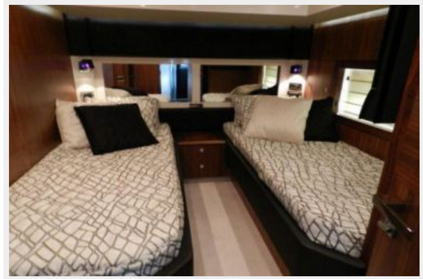
2008 Sunseeker Predator 92 Sport 'Yansika' - Guest En Suite