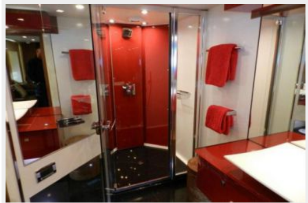
2008 Sunseeker Predator 92 Sport 'Yansika' - Master En Suite 2008 Sunseeker Predator 92 Sport 'Yansika' - Forward VIP Cabin