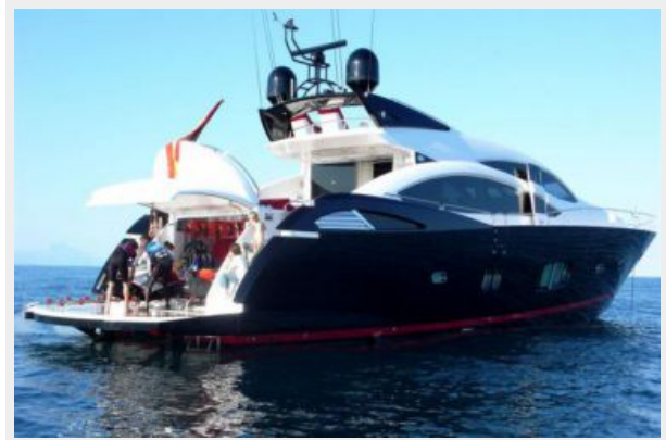
2008 Sunseeker Predator 92 Sport 'Yansika' - Sports Fly 2008 Sunseeker Predator 92 Sport 'Yansika' - Sports Fly