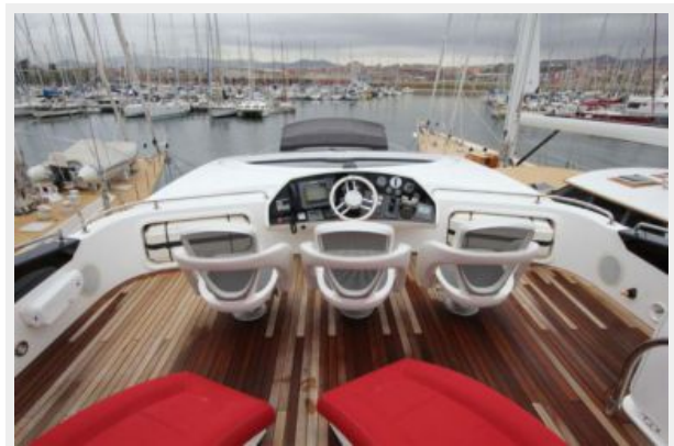
2008 Sunseeker Predator 92 Sport 'Yansika' - Sports Fly 2008 Sunseeker Predator 92 Sport 'Yansika' - Foredeck