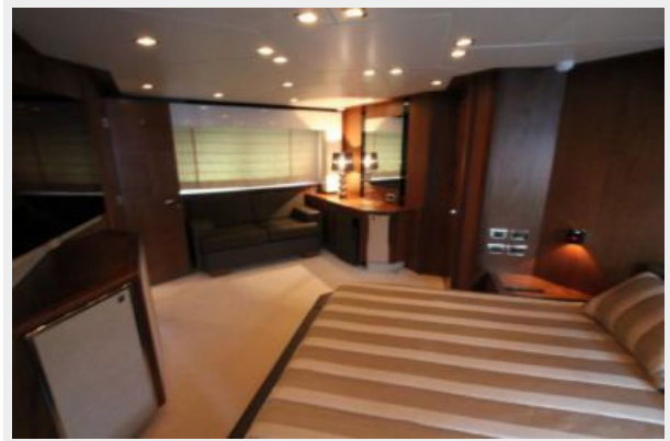
2008 Sunseeker Predator 92 Sport 'Yansika' - Master En Suite 2008 Sunseeker Predator 92 Sport 'Yansika' - Master En Suite