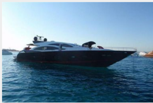
2008 Sunseeker Predator 92 Sport 'Yansika' 2008 Sunseeker Predator 92 Sport 'Yansika'