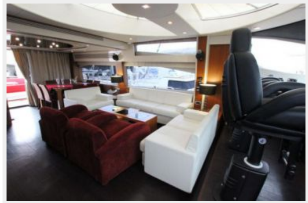
2008 Sunseeker Predator 92 Sport 'Yansika' - Saloon TV 2008 Sunseeker Predator 92 Sport 'Yansika' - Saloon