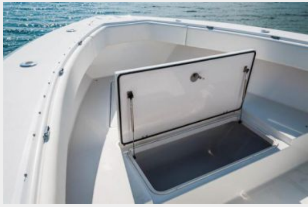
Freezer Fish Box