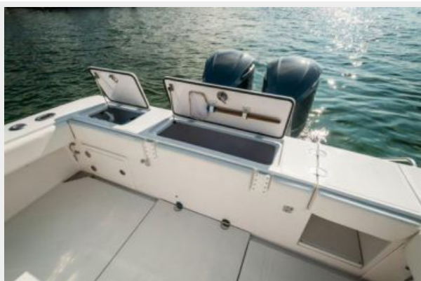
Transom Livewell and Work Station