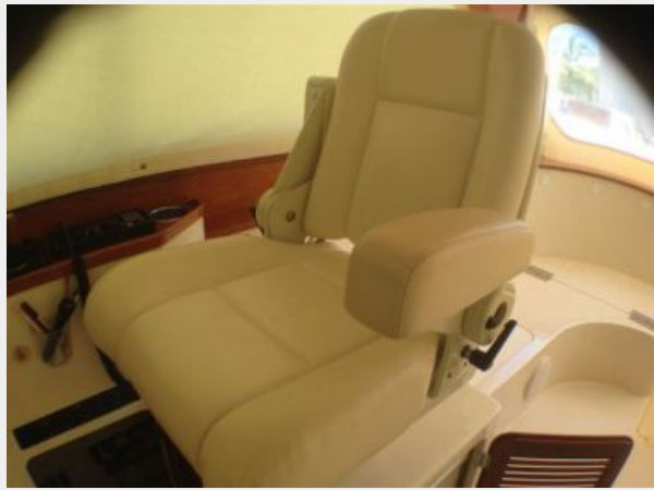
Stidd Helm Chair