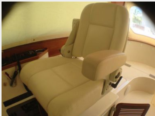
Stidd Helm Chair