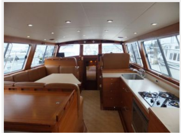
Main Salon Fwd