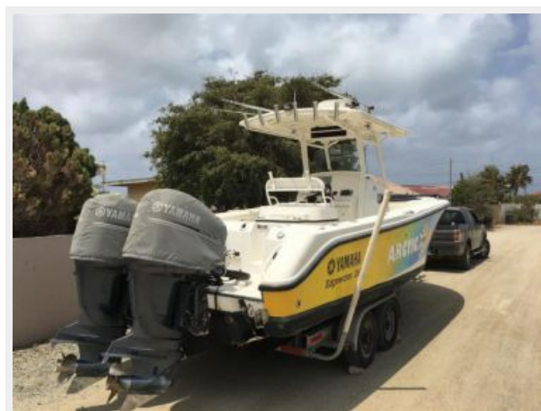
Edgewater 268 for sale 2007