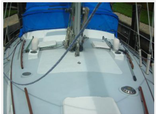
Large cabin top area