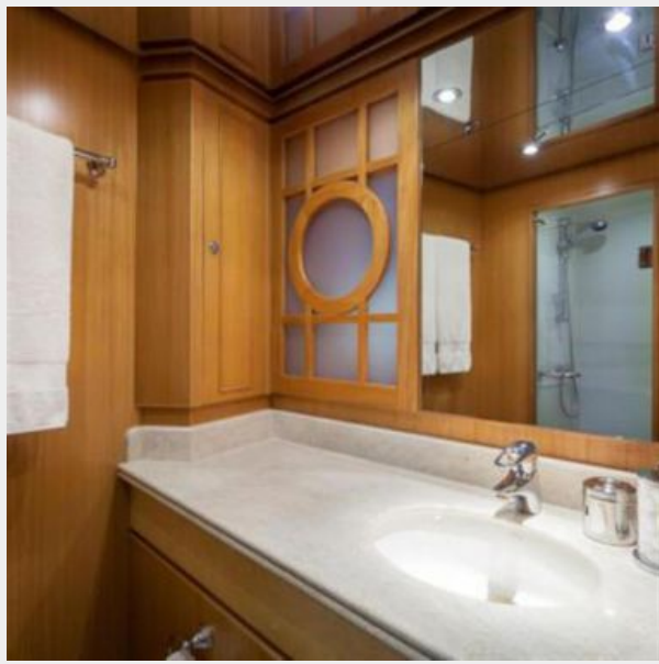
VIP Head / Port