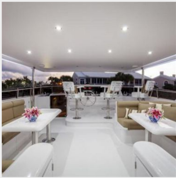
Flybridge / Helm