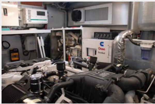
Engine Room / Forward to Starboard