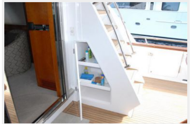
Aft Deck / Storage