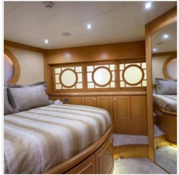
VIP Stateroom / Port