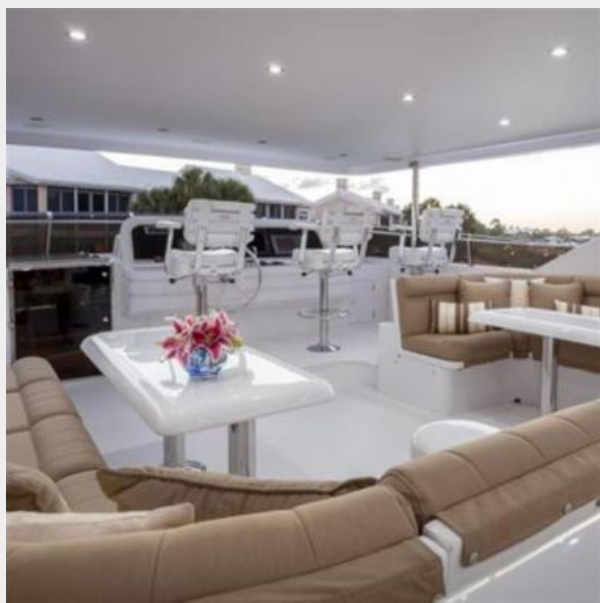
Flybridge / Seating