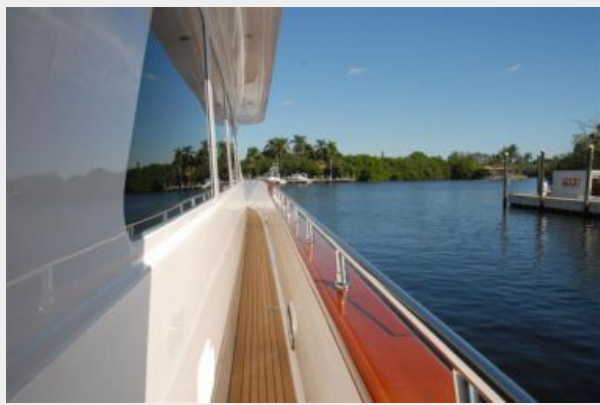
Walk-Around Deck / Starboard