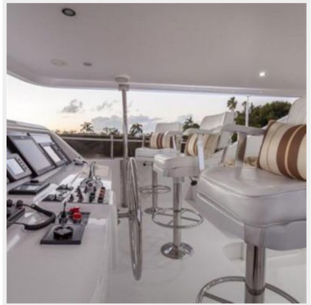
Flybridge / Helm