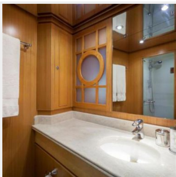
VIP Head / Port