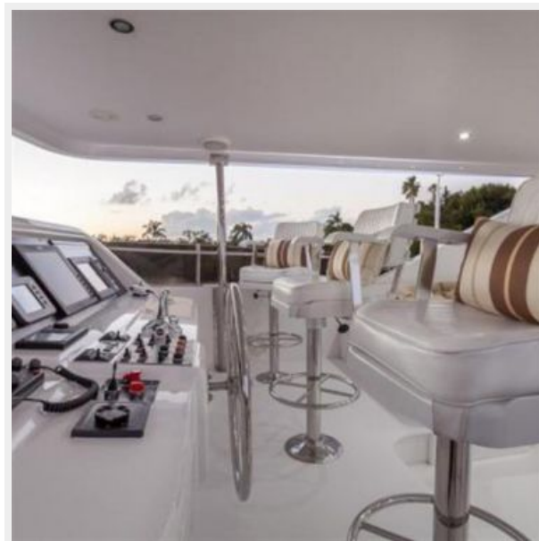
Flybridge / Helm