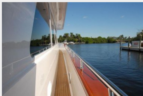
Walk-Around Deck / Starboard