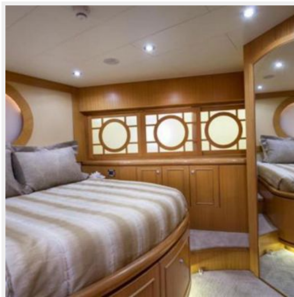
VIP Stateroom / Port