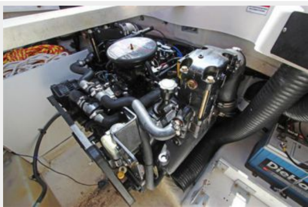
Upgraded 4.3L Mercruiser Engine