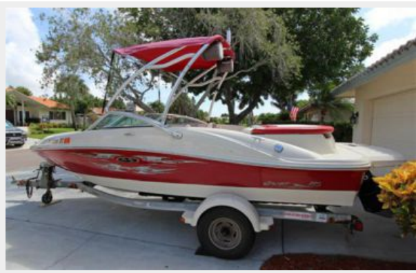
Aluminum Wake-Board Tower W/Bimini Top