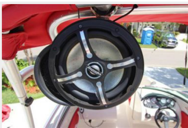
Bazooka Tube Marine Speakers Mounted To Tower