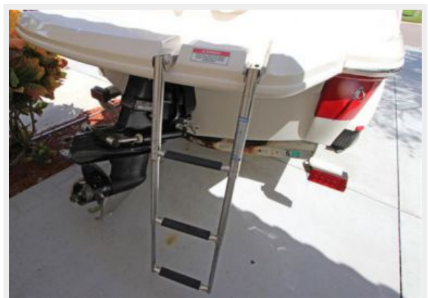
Fold-Down Stainless Swim Ladder