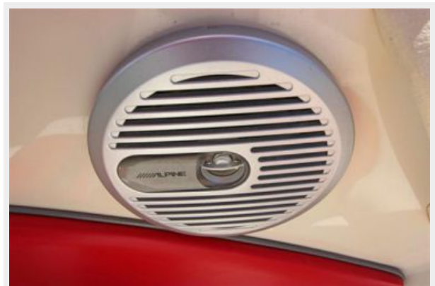
Alpine Marine Speakers