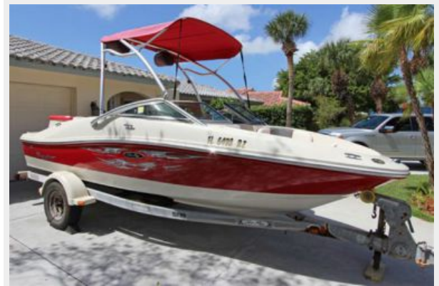
Custom Gelcoat & Graphics Package