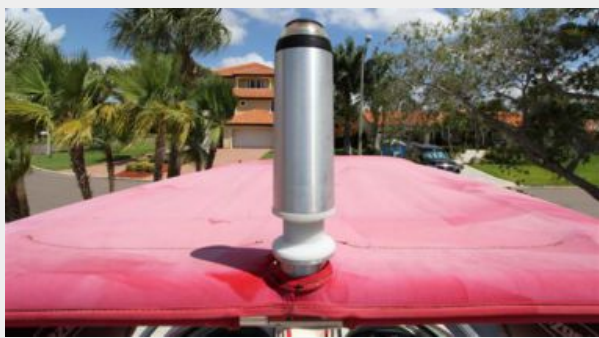
Wake-Boarding Pole On Tower