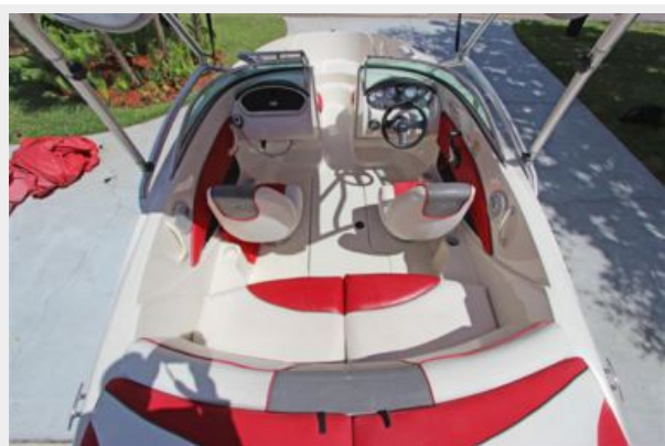
Transom Looking Forward