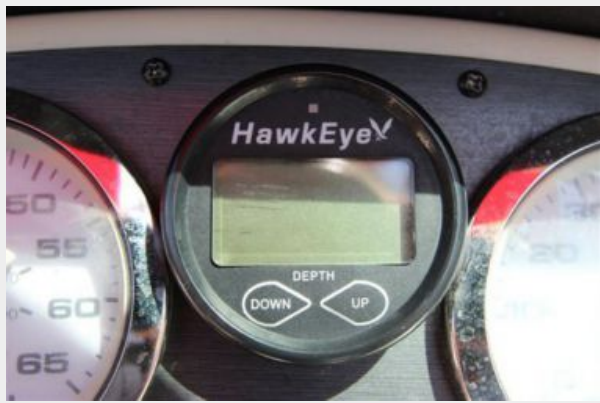
HawkEye Depth Sounder