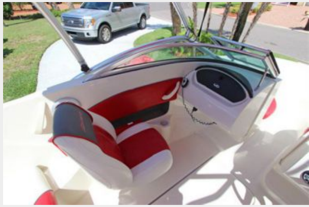
Port Passenger Chair