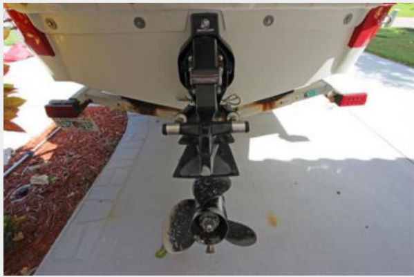
MerCruiser Alfa One Drive