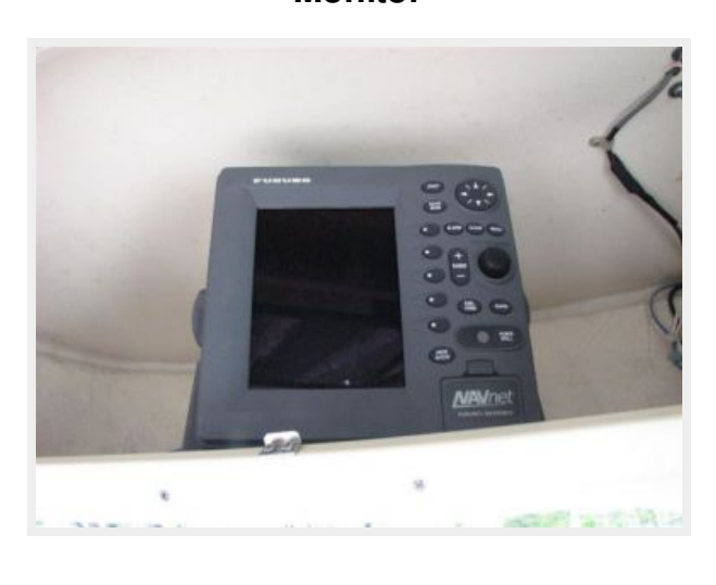
Helm / Electronics & Navigation 3 - Furuno Monitor