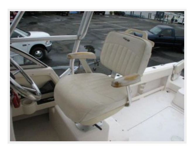
Deck 1 - Helm Seat