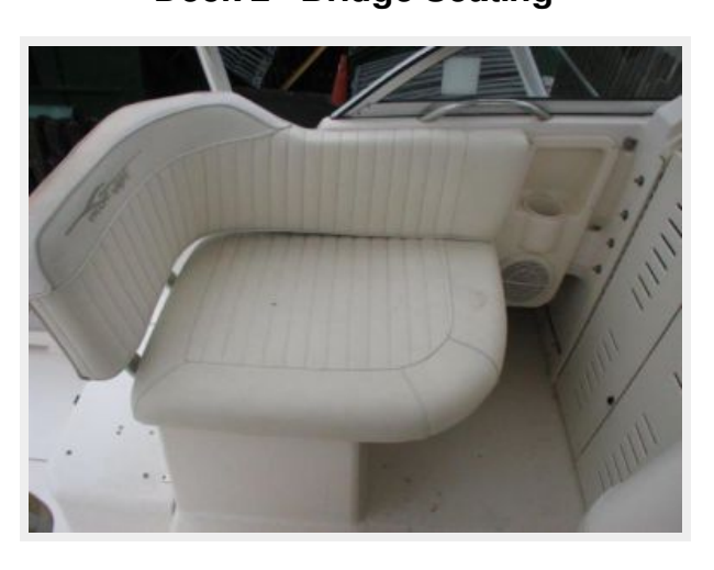
Deck 2 - Bridge Seating