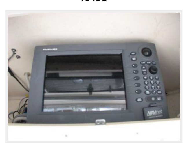
Helm / Electronics & Navigation 2 - Furuno 1943C