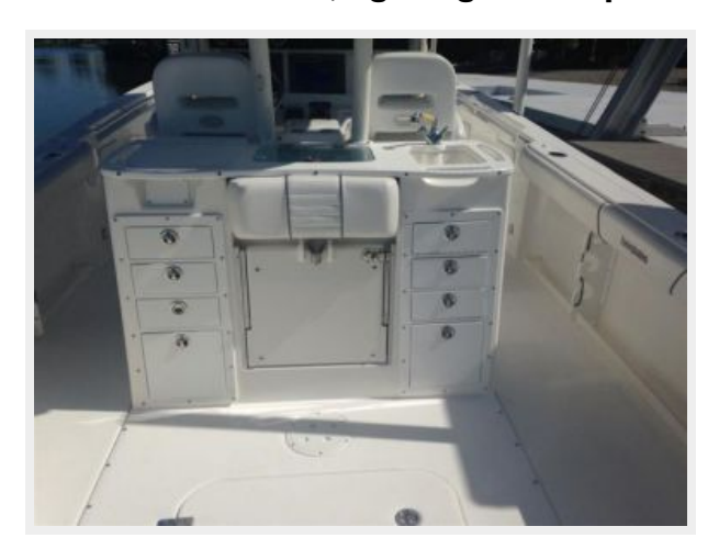
Tackle station, fighting chair up