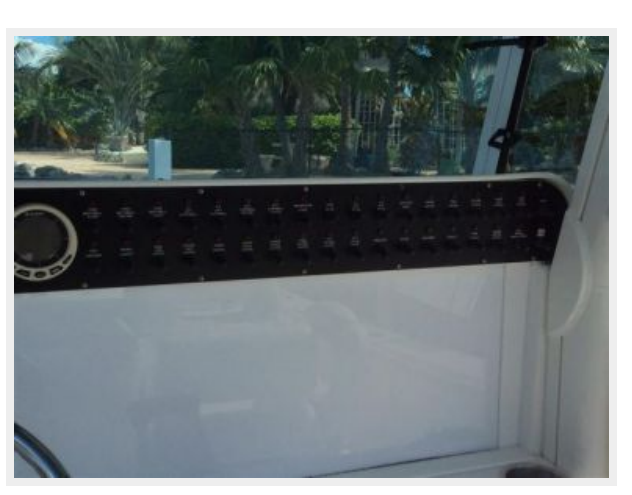
Canvas cover boat kept on lift