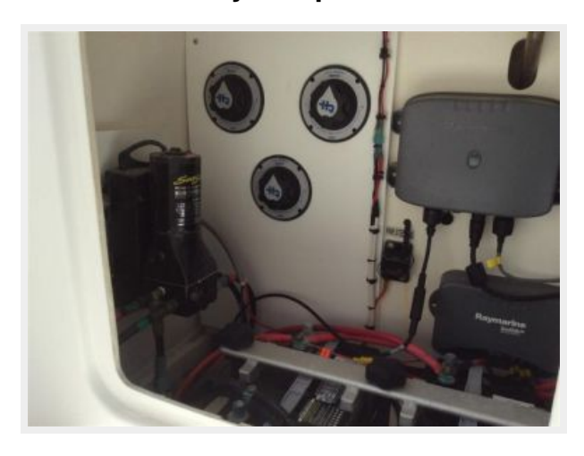
Storage between helm seats