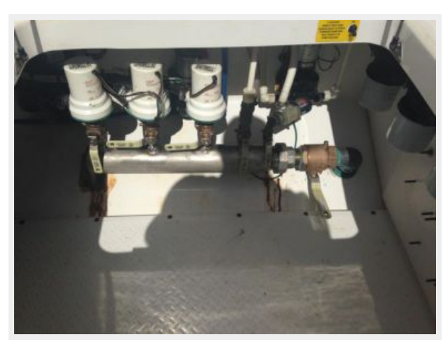
Bilge, livewell pumps with manifold