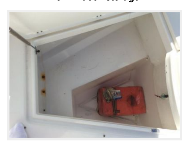
Bow in deck storage