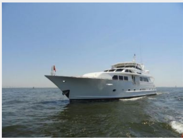
Bow Profile Port Side