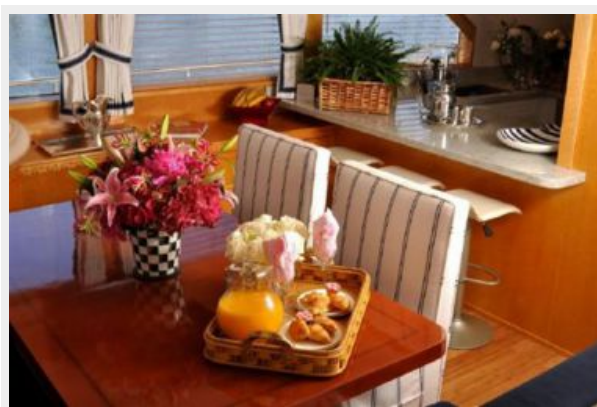
Country Kitchen Dining