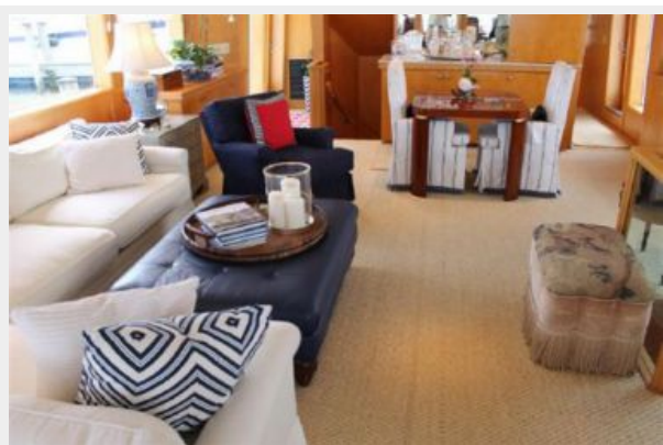
Main Salon Looking Forward