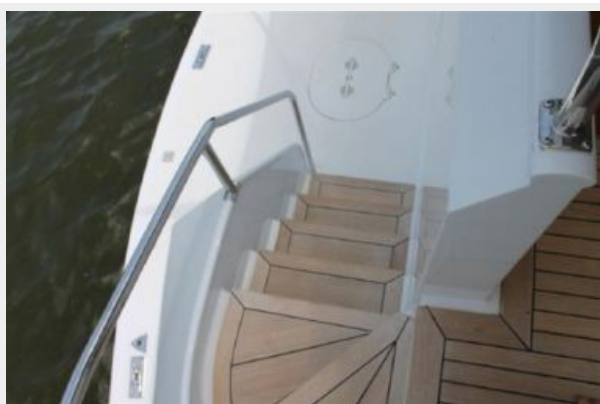
Aft Spiral Stairs