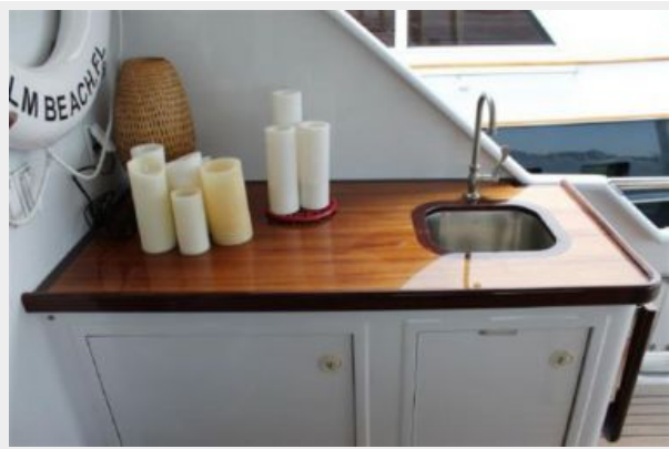
Aft Deck Wet Bar