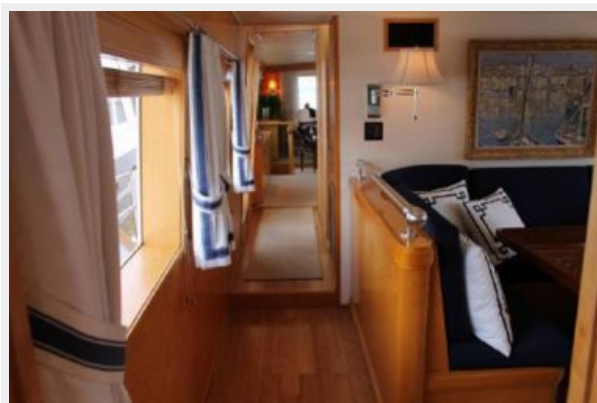
Passage from Dining to Salon