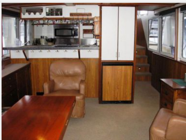
Salon View Forward