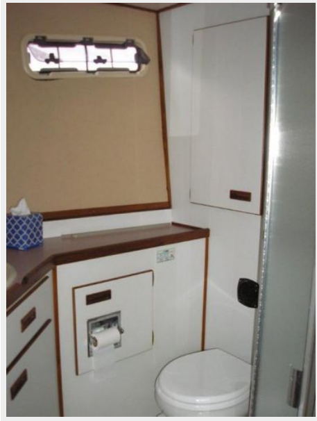
Port Head & Shower