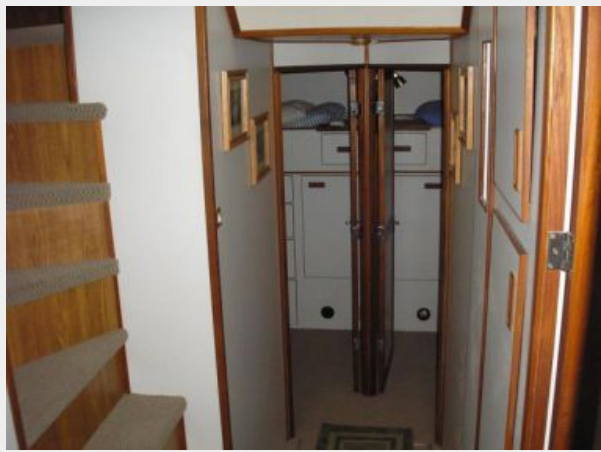
Aft to Twin Guest Staterooms