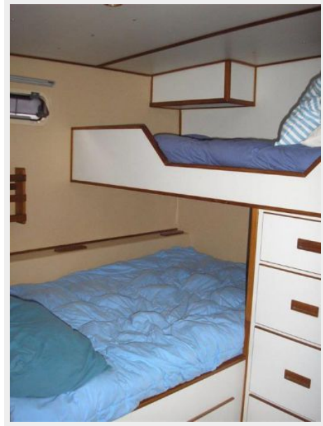
Starboard Guest Stateroom