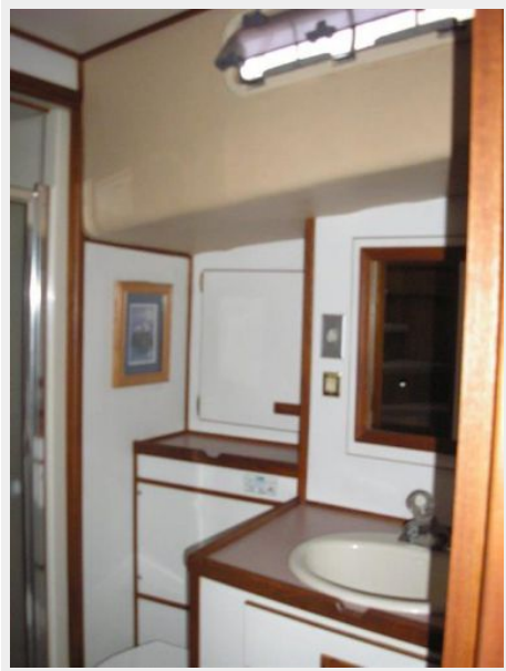
Starboard Head & Shower