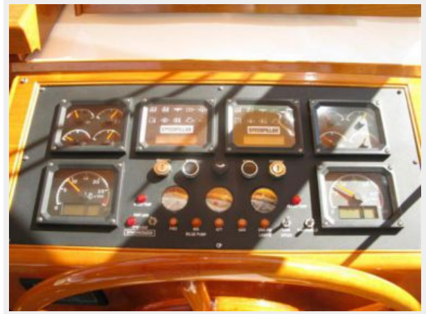
Lower Helm Panel