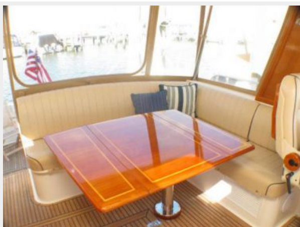
Large Leaf Table