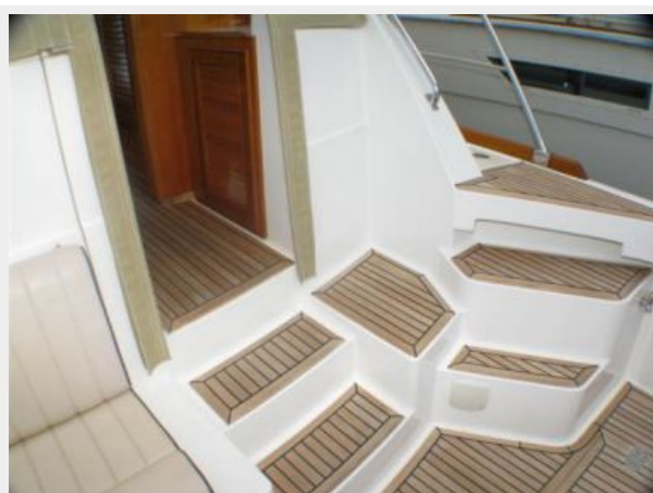
Pilothouse and Side deck Access