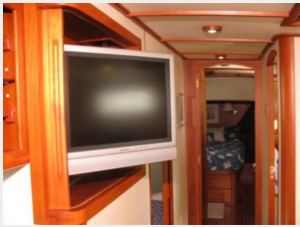
TV with Swivel Mount