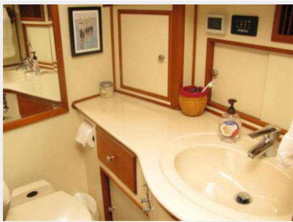
Master En-Suite Head