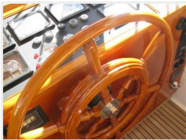
GB Ships Wheel