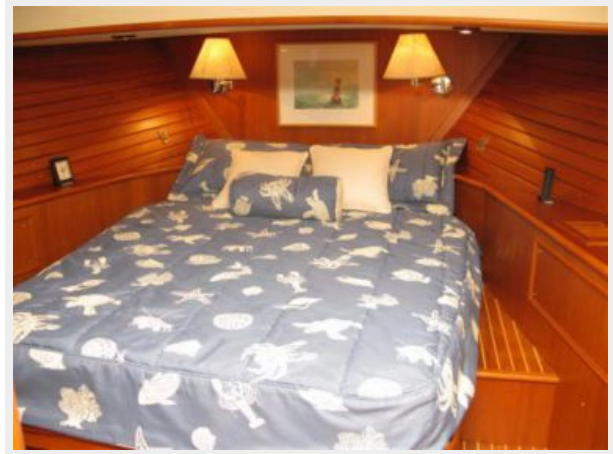
Master Queen Berth