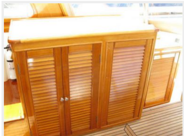
Helm Deck Cabinet