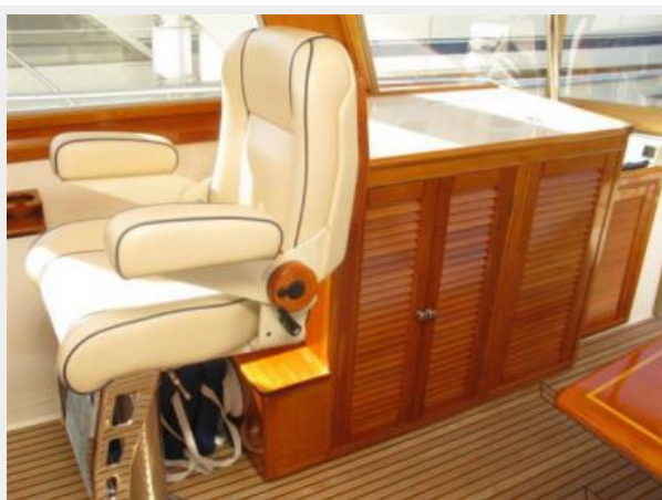
Helm Stidd Seat