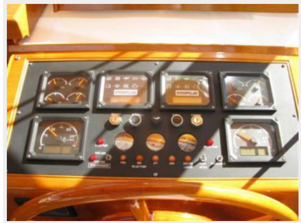
Lower Helm Panel