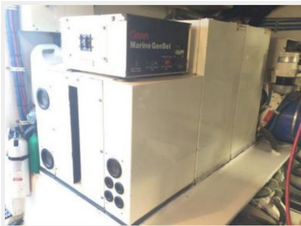
15 kW Onan Generator with 2238 hours