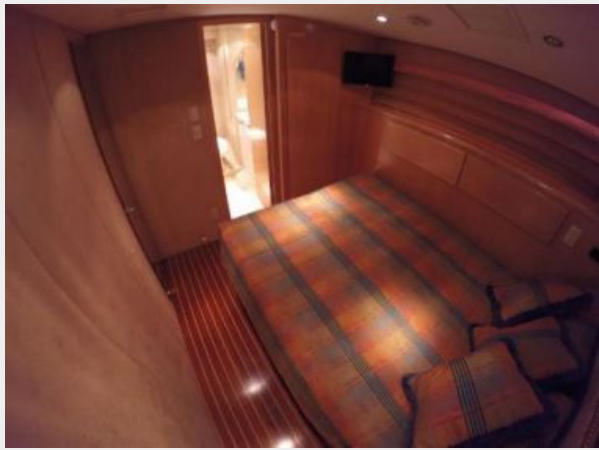
Master Stateroom facing forward