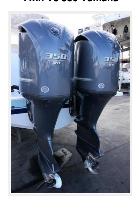
Twin V8 350 Yamaha