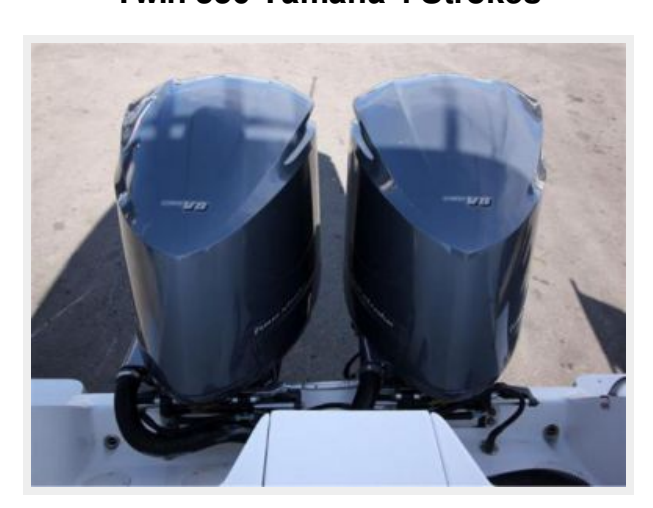
Twin 350 Yamaha 4 Strokes