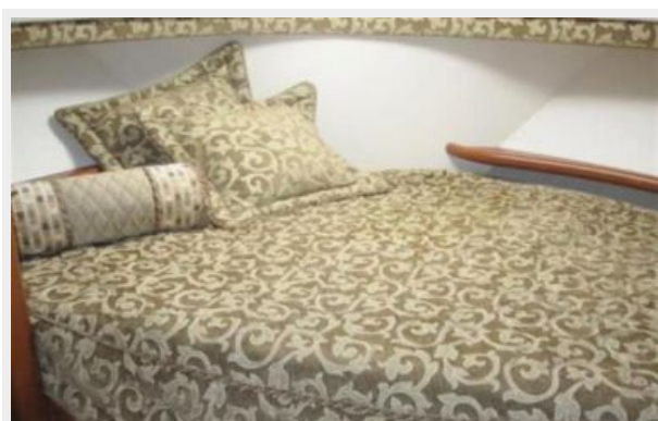
Forward Master Stateroom