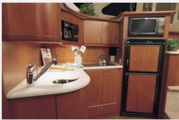
Manufacturer Provided Image: Galley