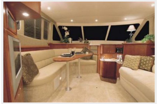
Manufacturer Provided Image: Salon