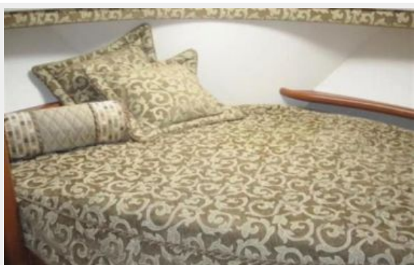
Forward Master Stateroom