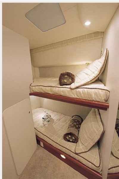
2nd Stateroom