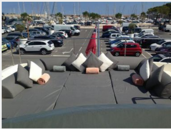
Sundeck aft sunbathing area