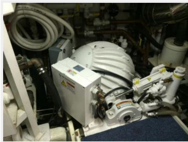
1st Gyro stabiliser