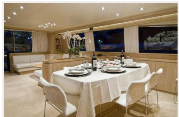
Main salon dining