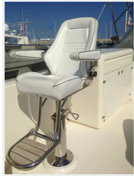
Owners sundeck chair