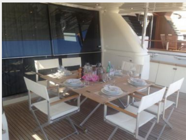
Main Deck aft dining