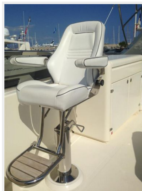
Owners sundeck chair