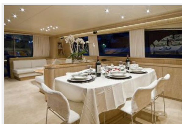
Main salon dining