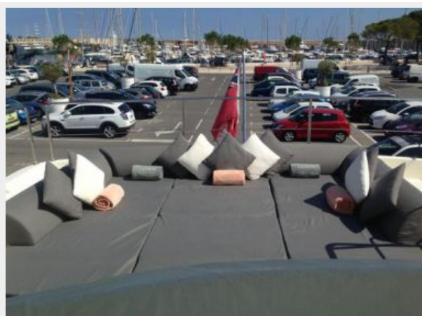
Sundeck aft sunbathing area