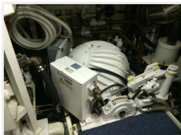
1st Gyro stabiliser