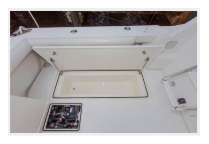
Fish Box Port