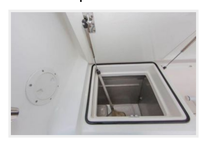
Cockpit Bait Freezer