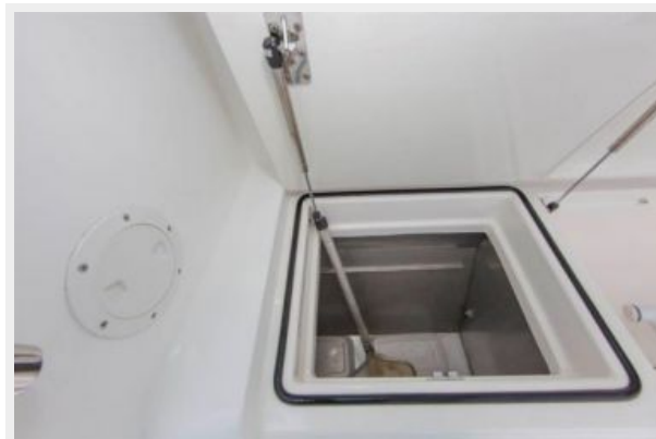
Cockpit Bait Freezer