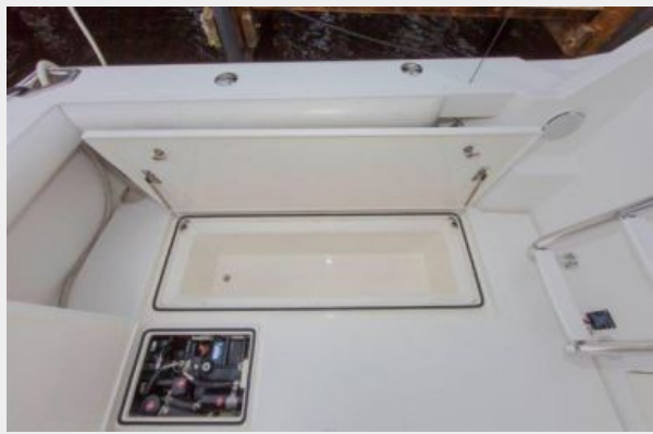
Fish Box Port