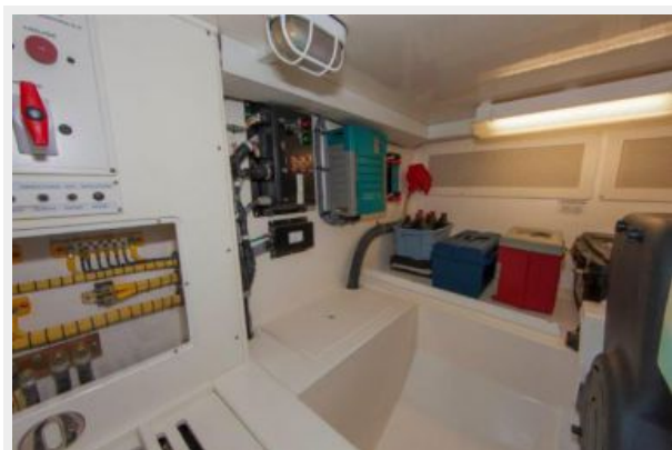
Engine Room Starboard Forward