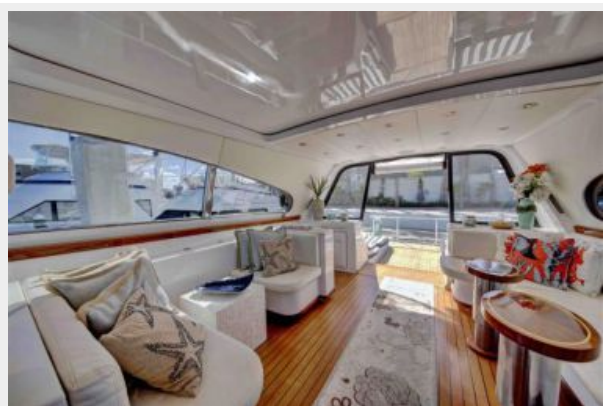
Upper salon 2