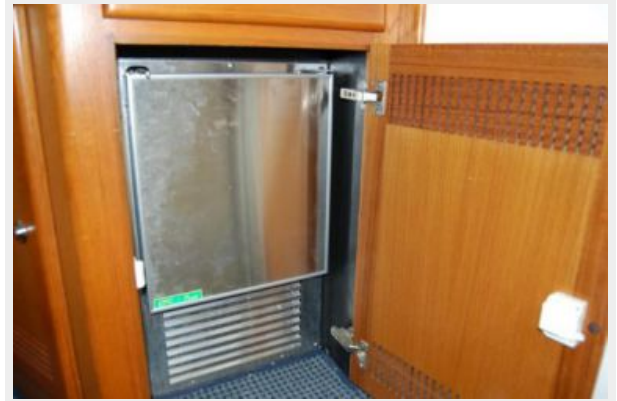
Salon Ice Maker