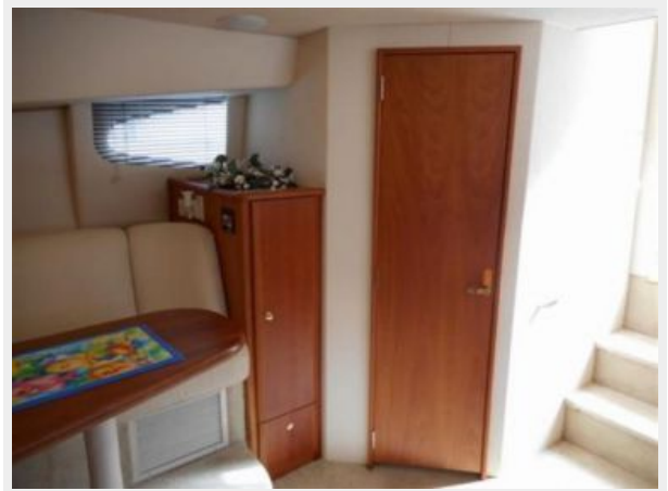
Salon port aft