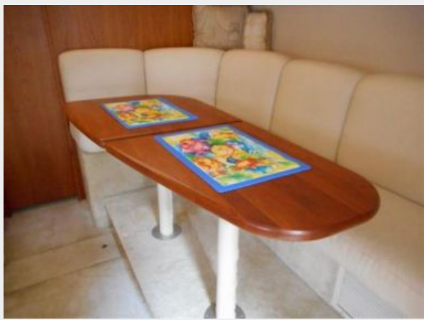
Salon dining table