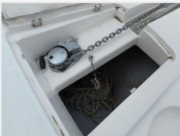
Windlass and anchor locker