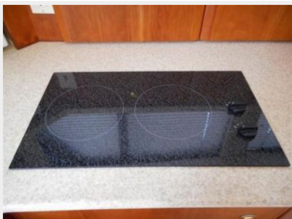
Galley electric stove top