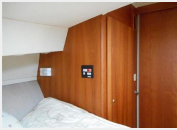
Master berth forward