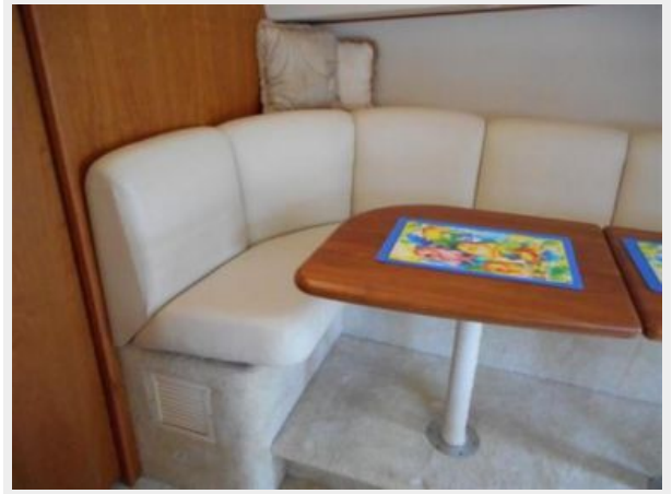
Salon starboard forward