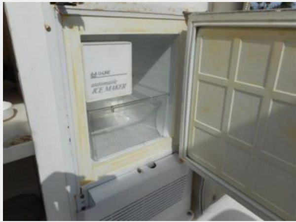
Aft deck ice maker