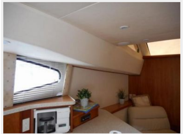
Salon Port forward