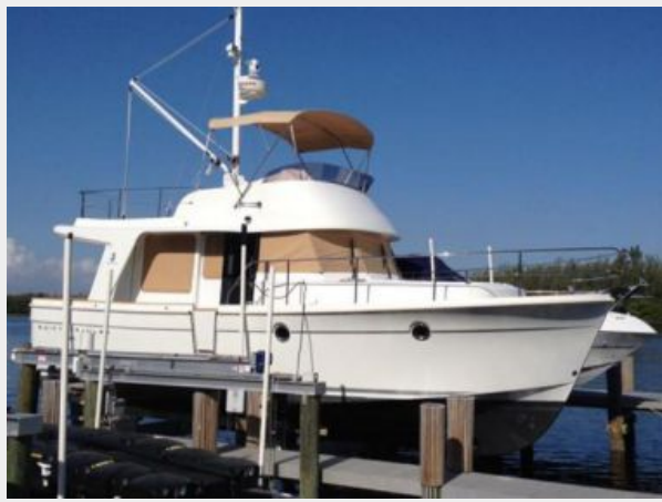
Lift Kept Since New