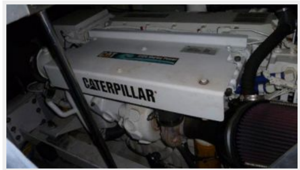
CAT 3126 Port Engine