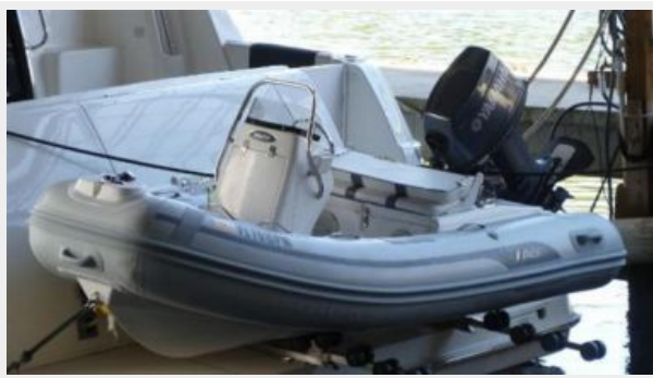
AB Inflatable tender w/40hp Yamaha