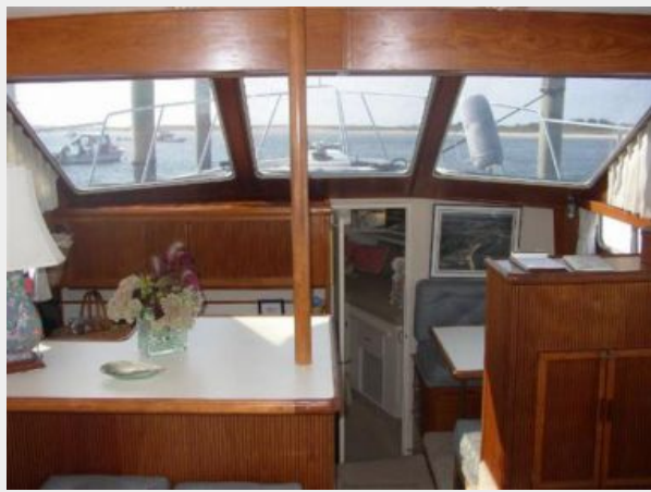
Forward from Salon