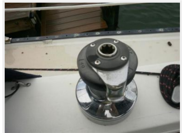
Powerful 40 ST Winches