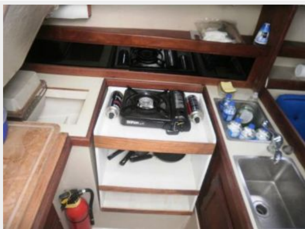
Single Burner Portable Propane Stove