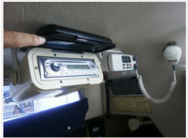
Sony CDX M10 CD/Stereo Radio Plus VHF