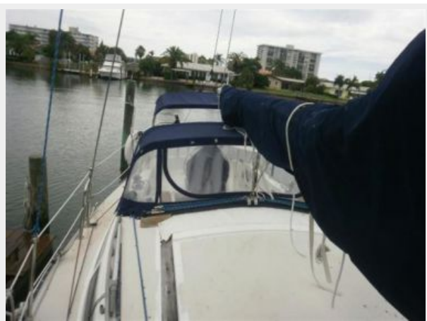
Looking Aft Starboard