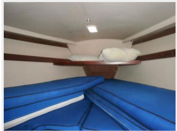
Front "V" Berth with Cockpit Cushions being stored