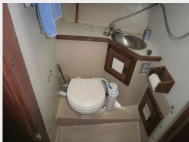
Head W/Vanity & sink