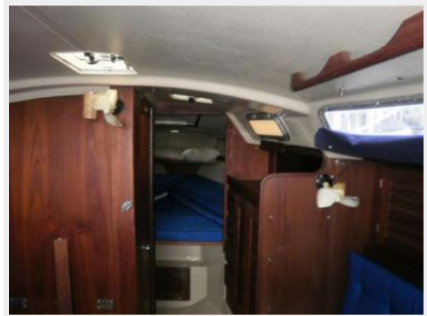
Hand Hold Rails on Cabin Top