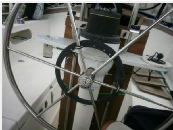
Destroyer style wheel w/Autopilot