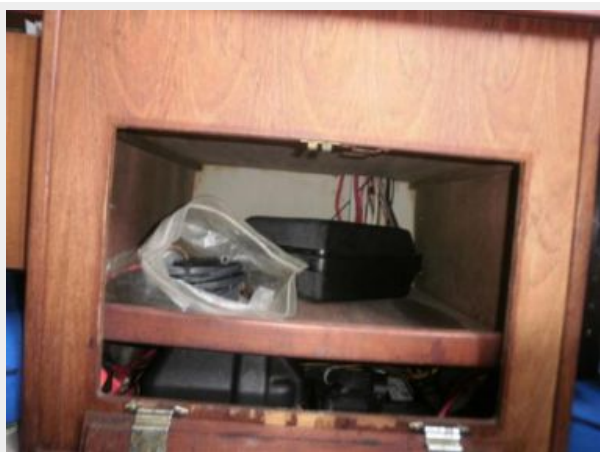
Loads of storage