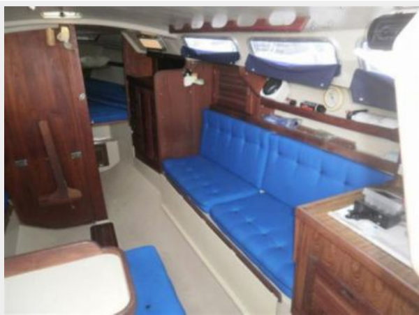
Starboard view of Settee