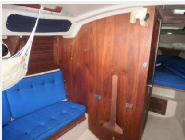
Looking Forward Port Side Covers on windows Missing Table stored here against Bulkhead