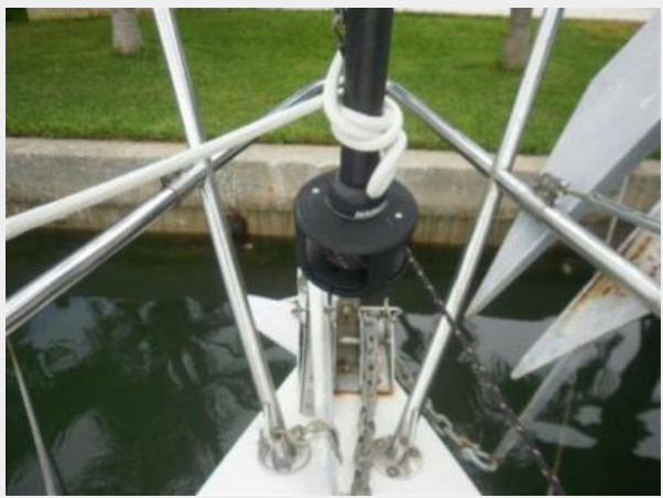
Roller Furling, Plow & Danforth Anchors on bow