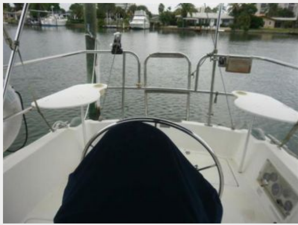
Perch Seats are VERY popular