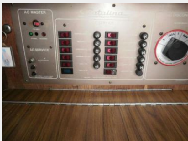
Electrical Panel right at Navigation Station