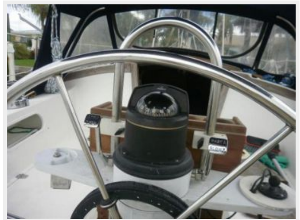
5" Ritchie Compass