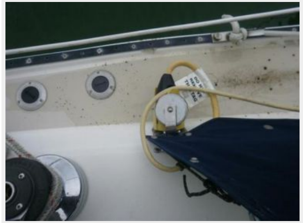
50Amp Power Connector $100 New