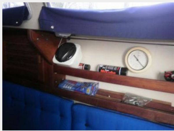
Cabin Stereo Speakers & Clock