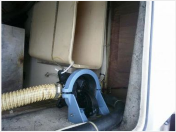
Aft hatch access to waste basket