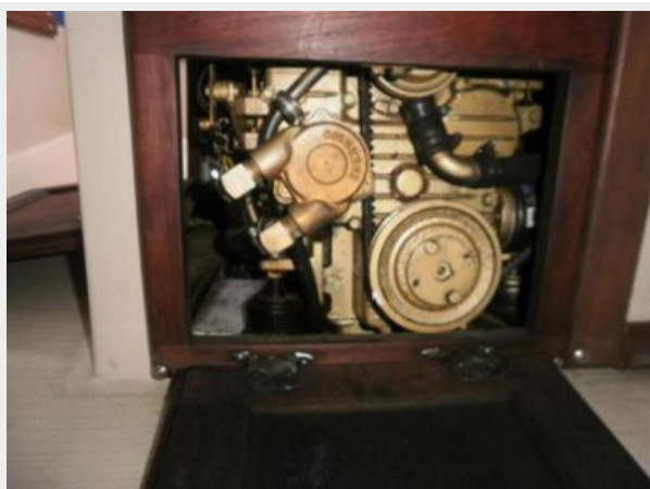
Easy access to engine