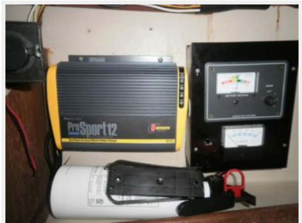
Pro Mariner Sport Battery Tender