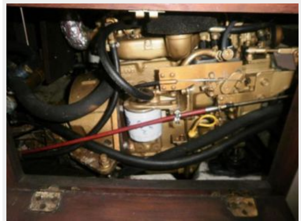
Universal 25hp 3-cylinder "rebuilt" engine