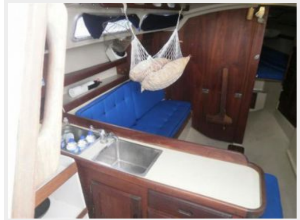
"L" Galley with lots of counter space