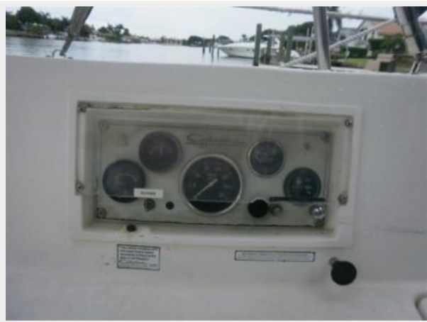
Engine Panel w/plastic cover