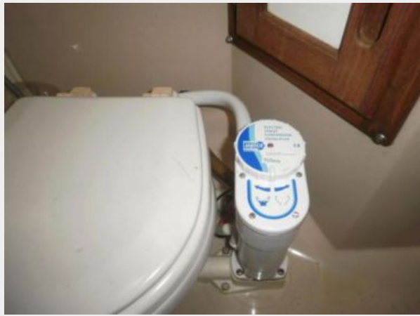
Electric Head Flush Toilet