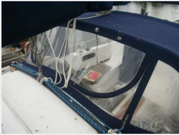
Great Canvas w/zip out window