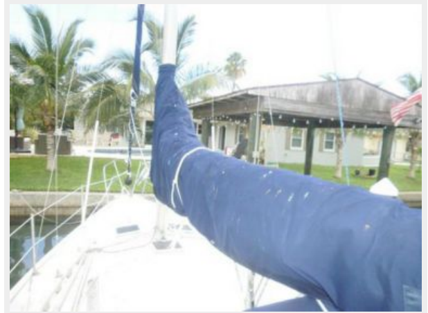
Looking Forward from cockpit