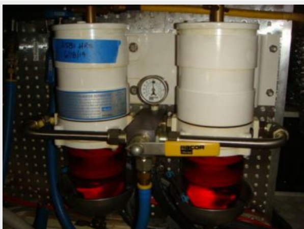
37' Mariner Seville Racor fuel filters