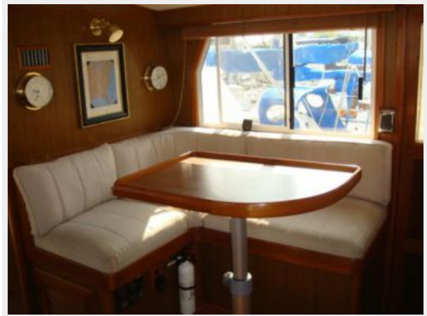
37' Mariner Seville pilothouse seating