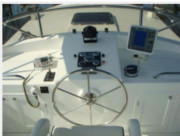
37' Mariner Seville flybridge helm