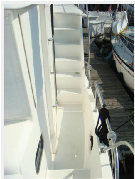
37' Mariner Seville port side deck photo1