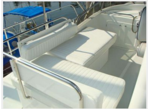
37' Mariner Seville flybridge seating photo2