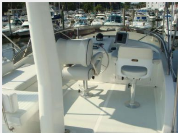
37' Mariner Seville flybridge forward