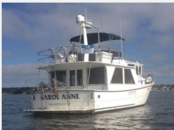
37' Mariner Seville starboard aft profile photo2