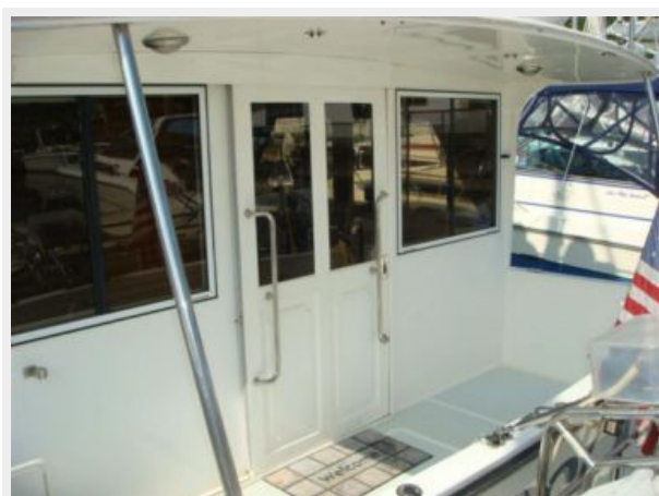
37' Mariner Seville aftdeck forward