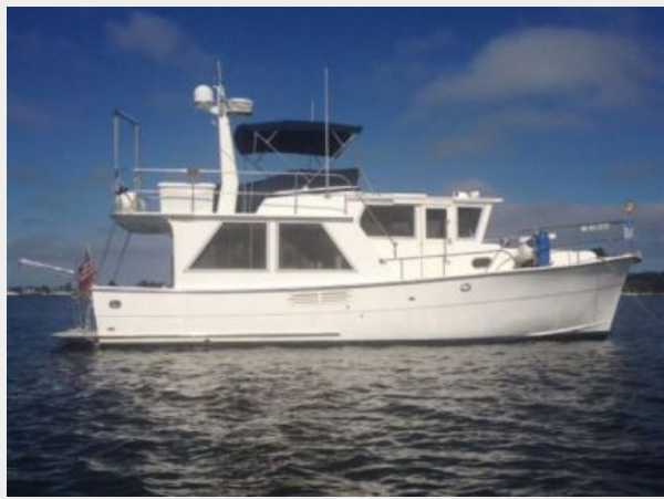
37' Mariner Seville starboard profile