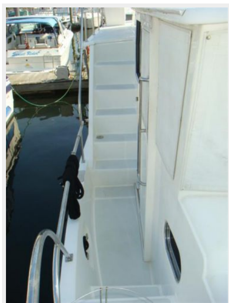
37' Mariner Seville starboard side deck photo1