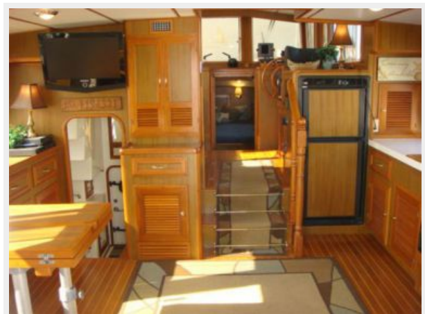
37' Mariner Seville salon forward