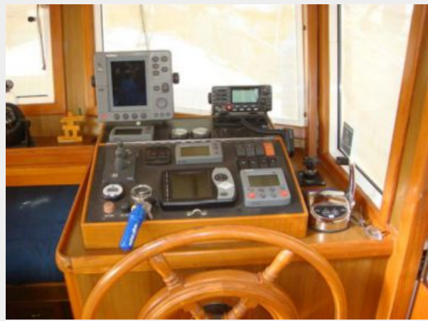
37' Mariner Seville pilothouse helm photo2