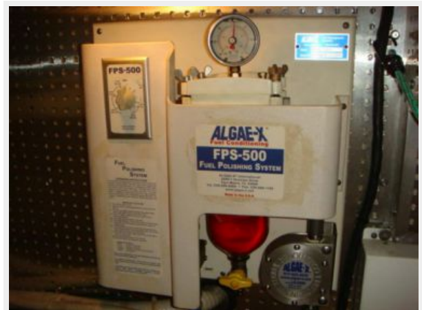
37' Mariner Seville fuel polishing system