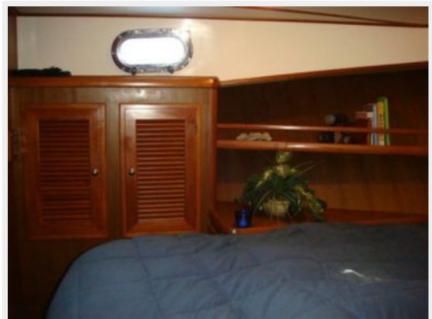
37' Mariner Seville master stateroom port