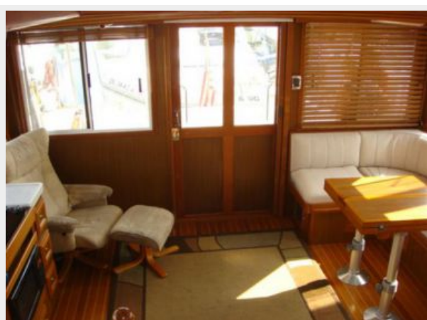
37' Mariner Seville salon aft