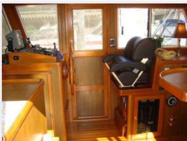
37' Mariner Seville pilothouse starboard