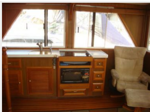
37' Mariner Seville salon starboard