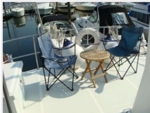
37' Mariner Seville flybridge aft