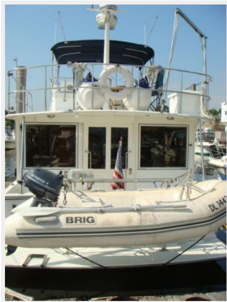
37' Mariner Seville aft profile