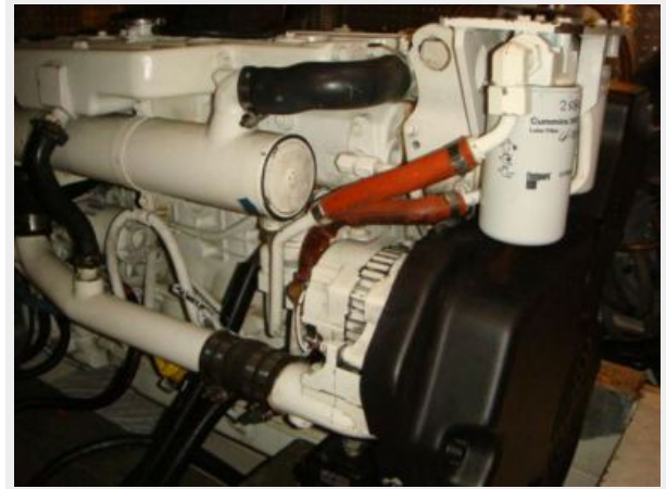
37' Mariner Seville main engine