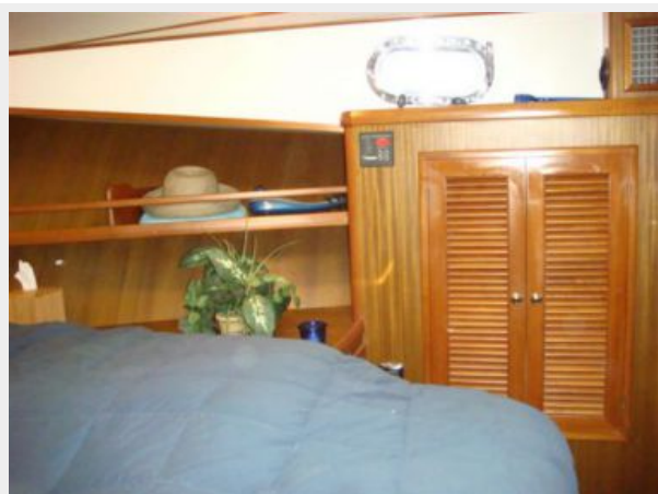
37' Mariner Seville master stateroom starboard