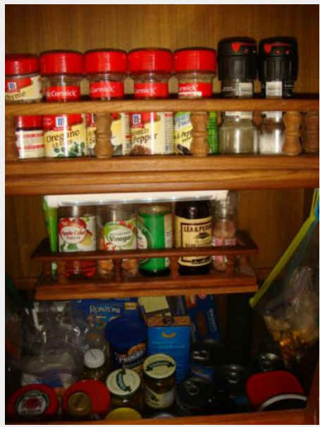
37' Mariner Seville galley dry storage