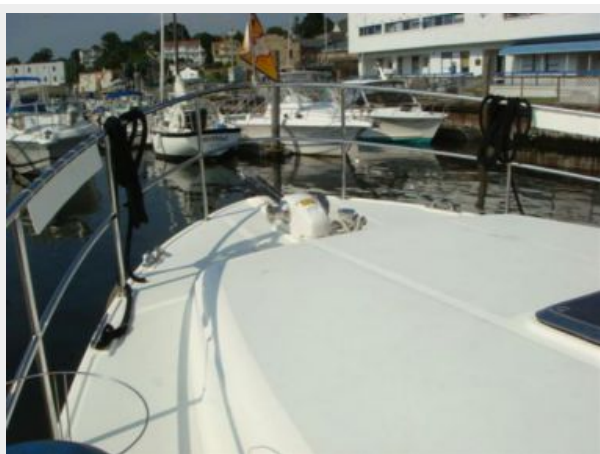
37' Mariner Seville foredeck