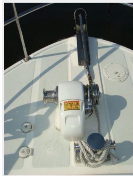
37' Mariner Seville anchor windlass