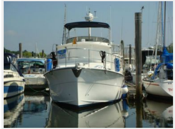
37' Mariner Seville forward profile