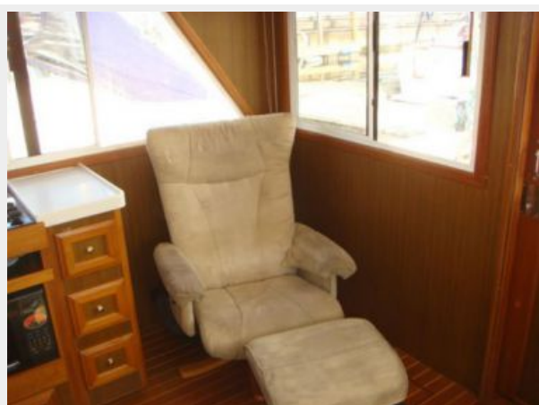
37' Mariner Seville salon starboard aft