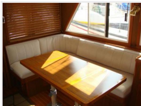
37' Mariner Seville salon seating photo2