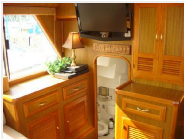
37' Mariner Seville salon port forward