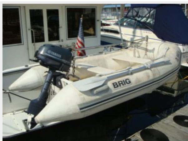
37' Mariner Seville tender photo3