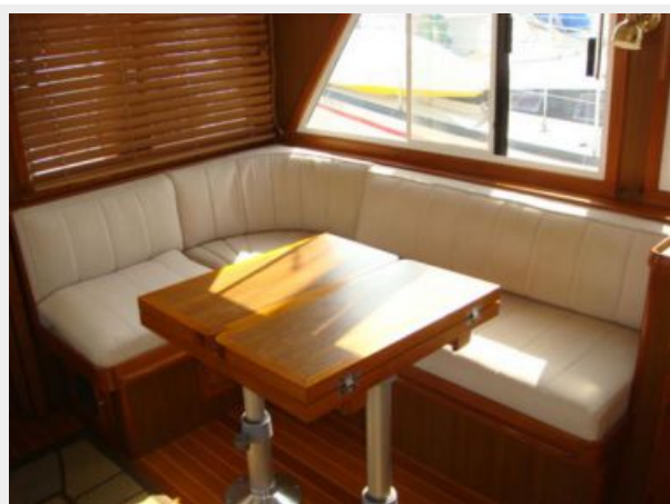
37' Mariner Seville salon seating photo1