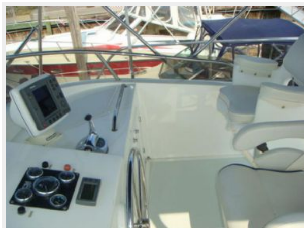
37' Mariner Seville flybridge starboard