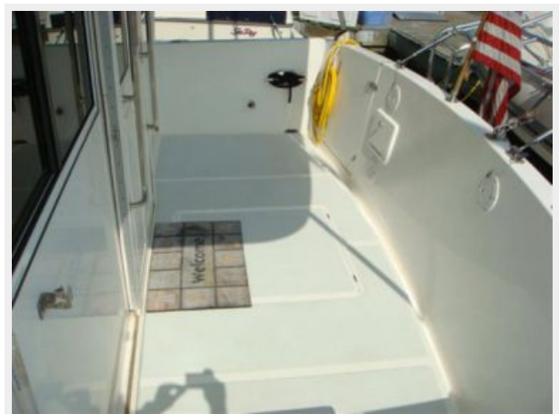
37' Mariner Seville aftdeck