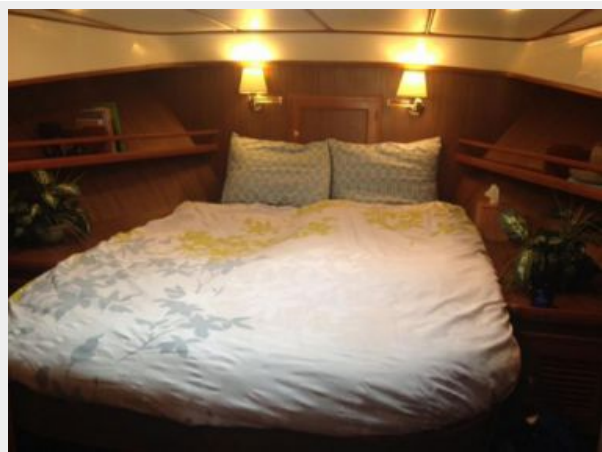
37' Mariner Seville master stateroom