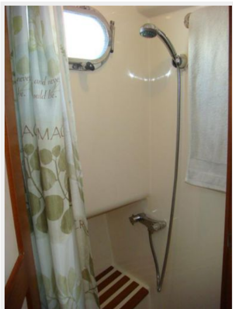
37' Mariner Seville master stateroom shower