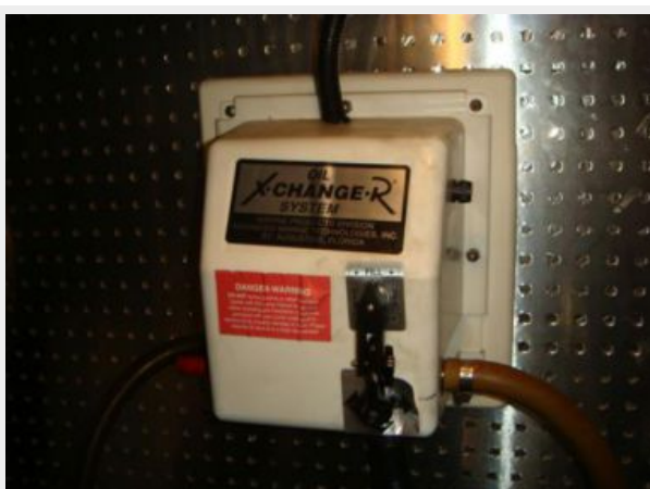
37' Mariner Seville oil change system