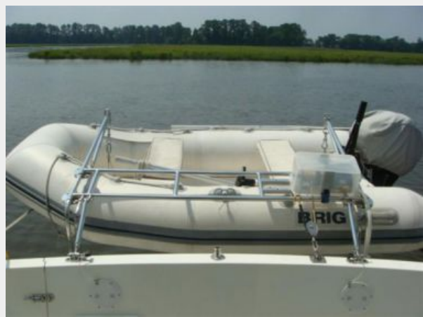
37' Mariner Seville tender photo1