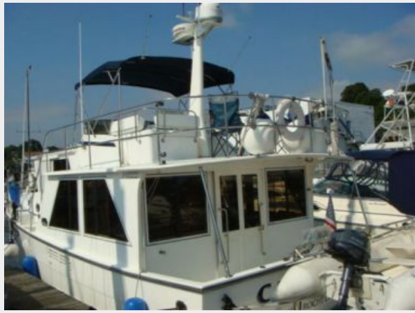
37' Mariner Seville port aft profile