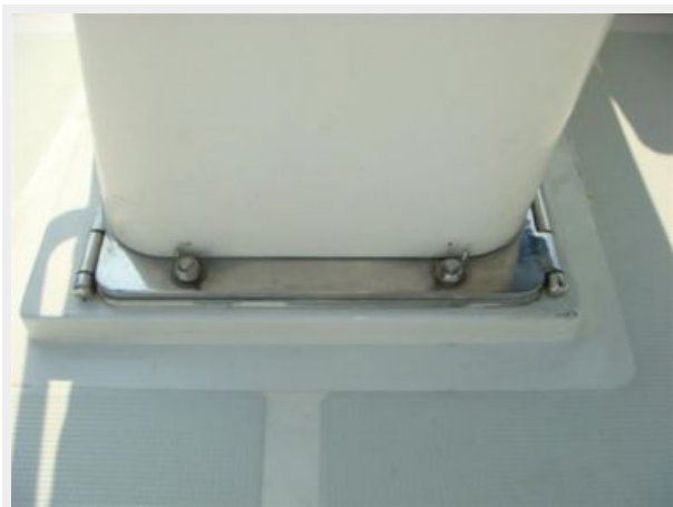
37' Mariner Seville hinged mast