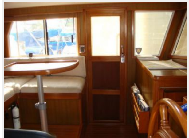
37' Mariner Seville pilothouse port