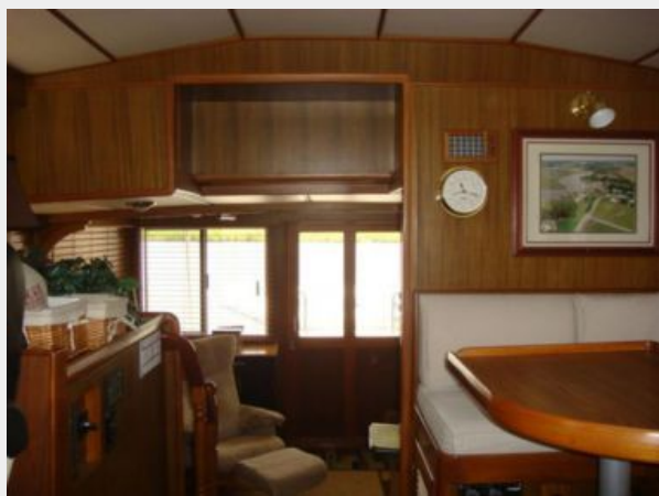
37' Mariner Seville pilothouse aft