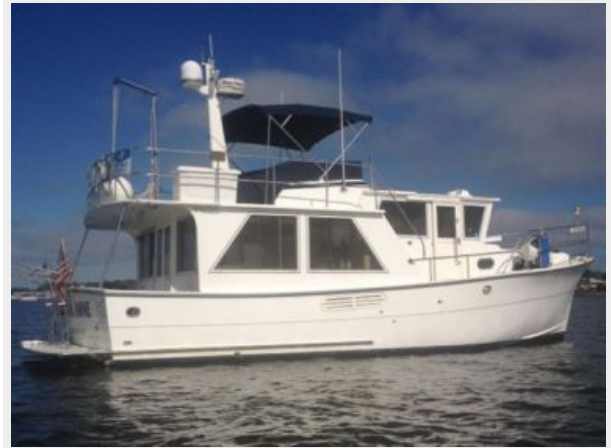
37' Mariner Seville starboard aft profile photo1