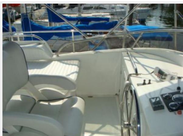
37' Mariner Seville flybridge port