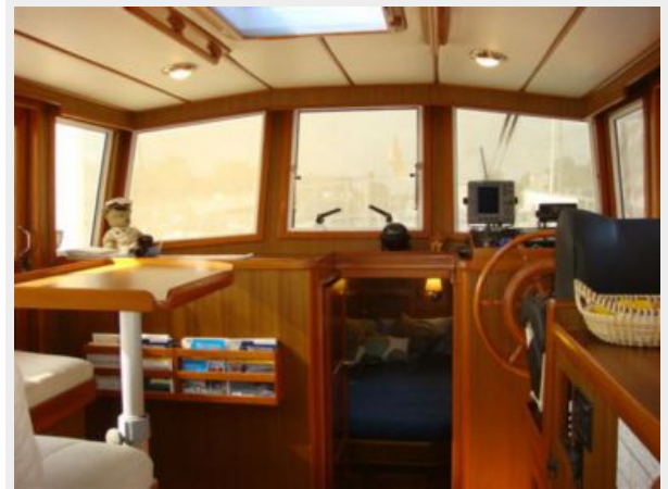
37' Mariner Seville pilothouse forward