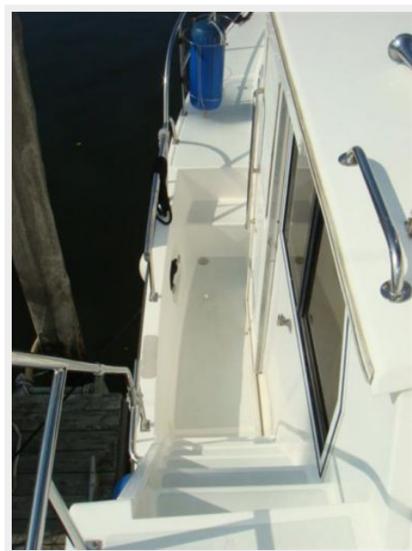
37' Mariner Seville port side deck photo2