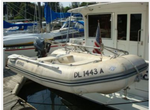
37' Mariner Seville tender photo2