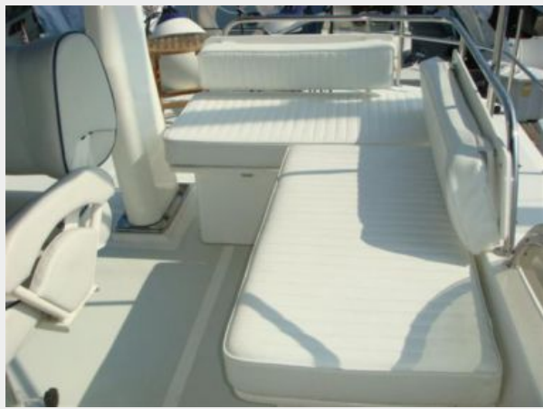
37' Mariner Seville flybridge seating photo1