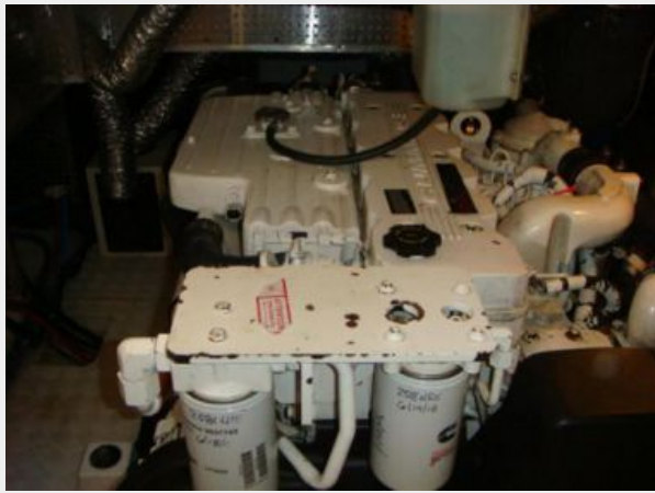
37' Mariner Seville engine room aft