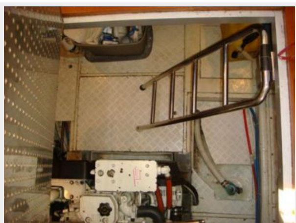
37' Mariner Seville engine room forward access