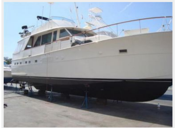
On the hard