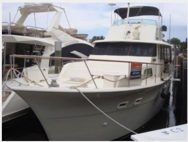
BOW CLOSE UJP