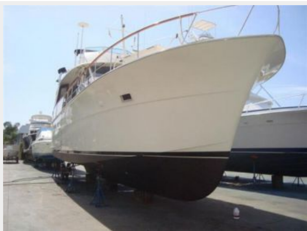
On the hard-2