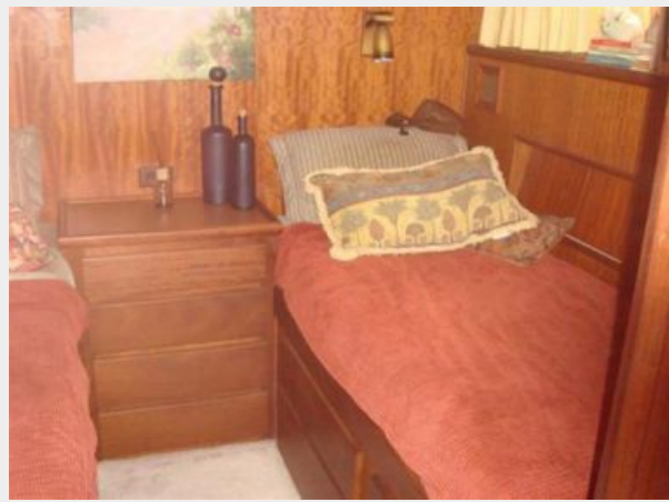
Midships Guest Stateroom