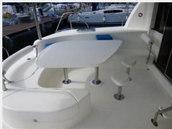
Cockpit Dining table