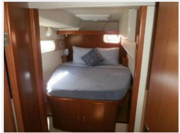
Aft Cabin- Starbd