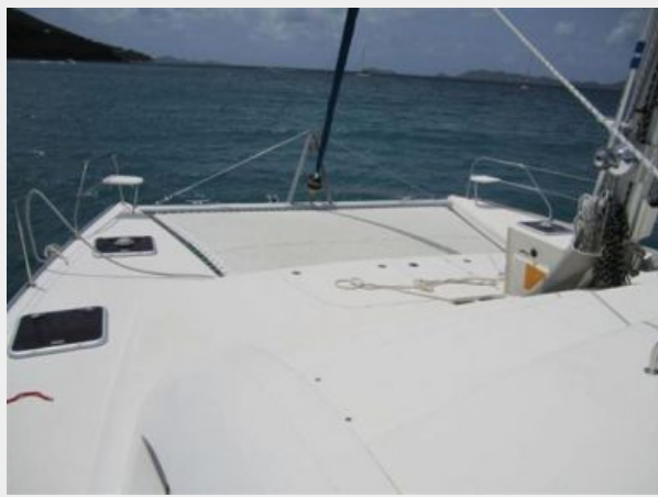
Forward Deck = Tramp