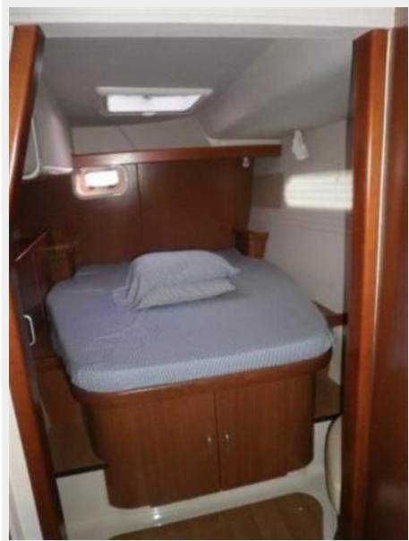
Aft Cabin Port