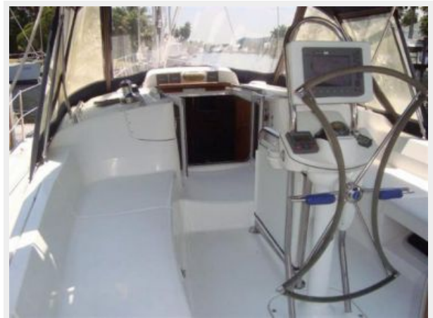
Cockpit - Folding wheel