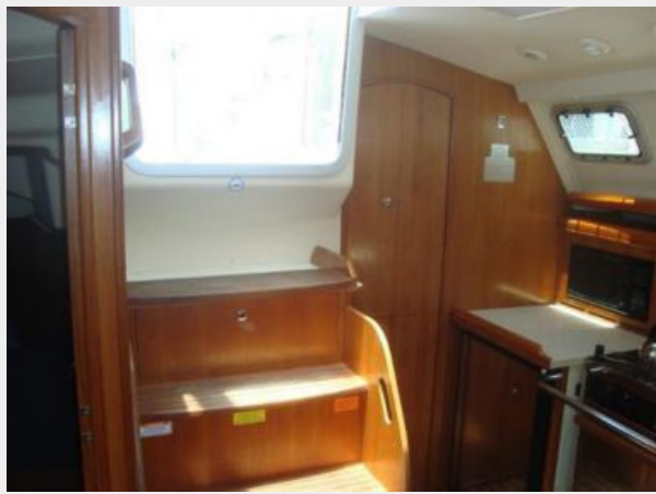
Steps to cockpit