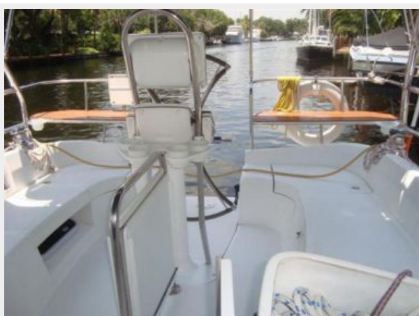
Cockpit Aft View