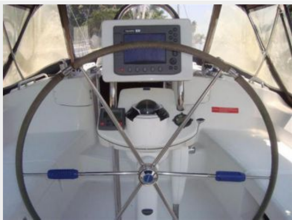
Cockpit - Folding wheel