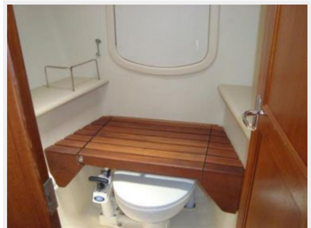
Manufacturer Provided Image: Forward Cabin