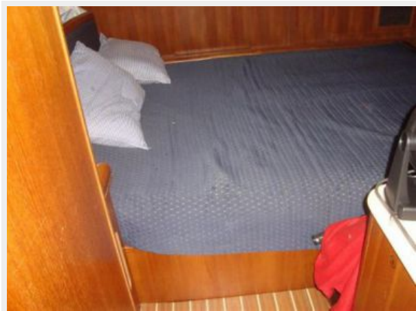
Manufacturer Provided Image-Aft Cabin