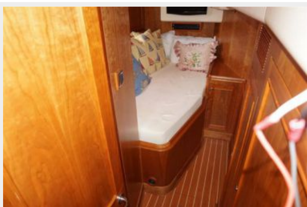
Starboard Guest VIP