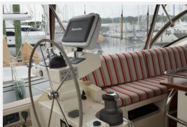
Port Helm Station