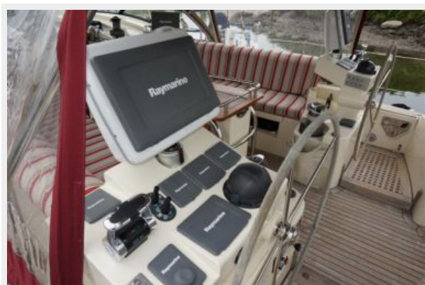
Scanstrut Pods at Helms and Forward