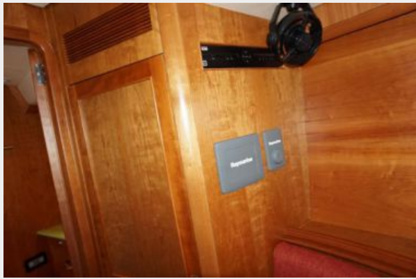
Remote Sailing Instruments in Master