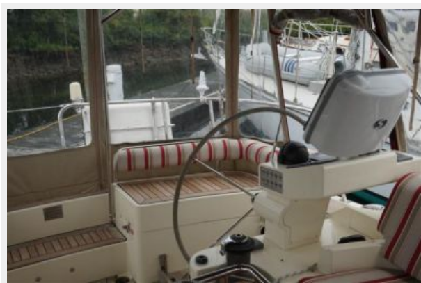
Port Helm Looking Aft