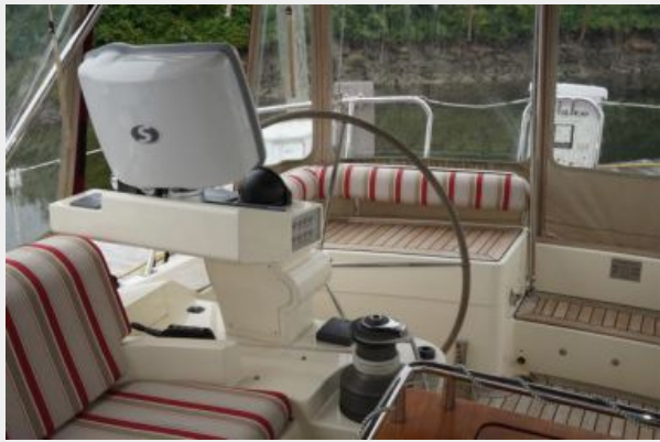
Starboard Helm Looking Aft