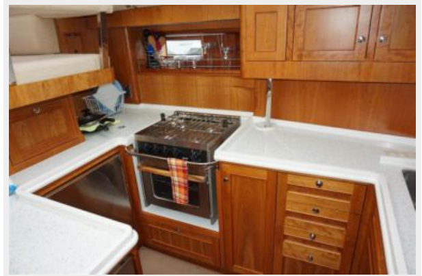
Galley Aft Port