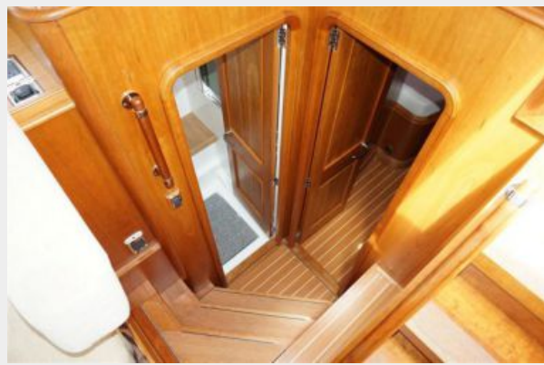
Aft and Down Starboard VIP Double