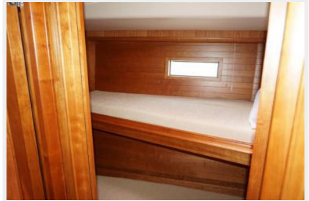
Forward Starboard Childrens Cabin