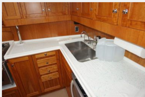
Galley Port Forward