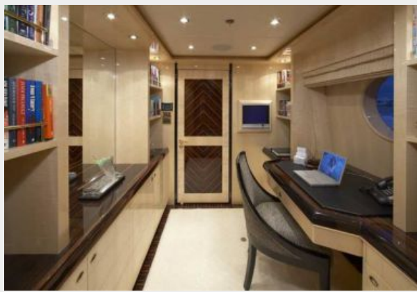
Master Stateroom Office, Upper Deck