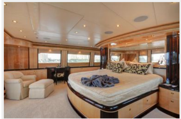
Master Stateroom, Upper Deck