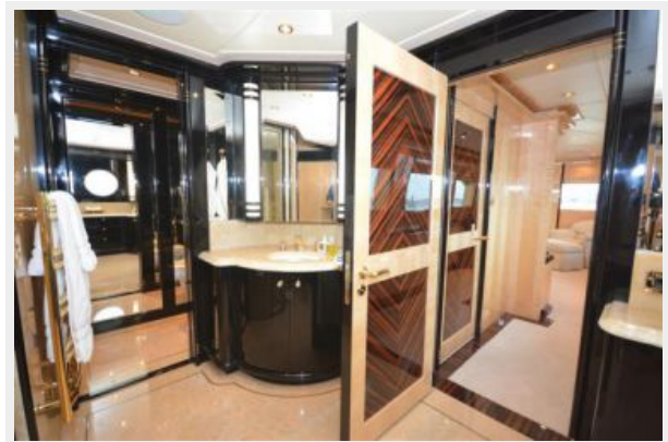
Master Bath, Upper Deck